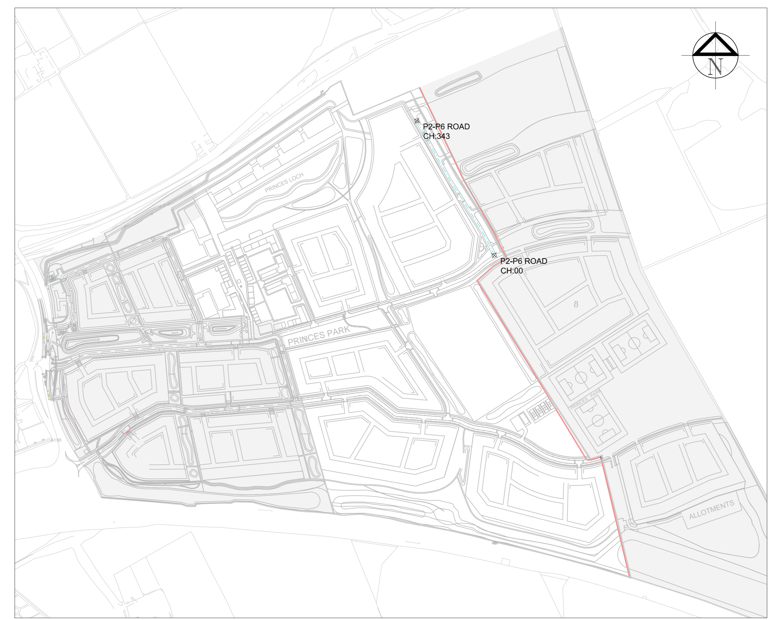
PROPOSED ROAD LONG SECTION LOCATIONS SCALE 1:5000