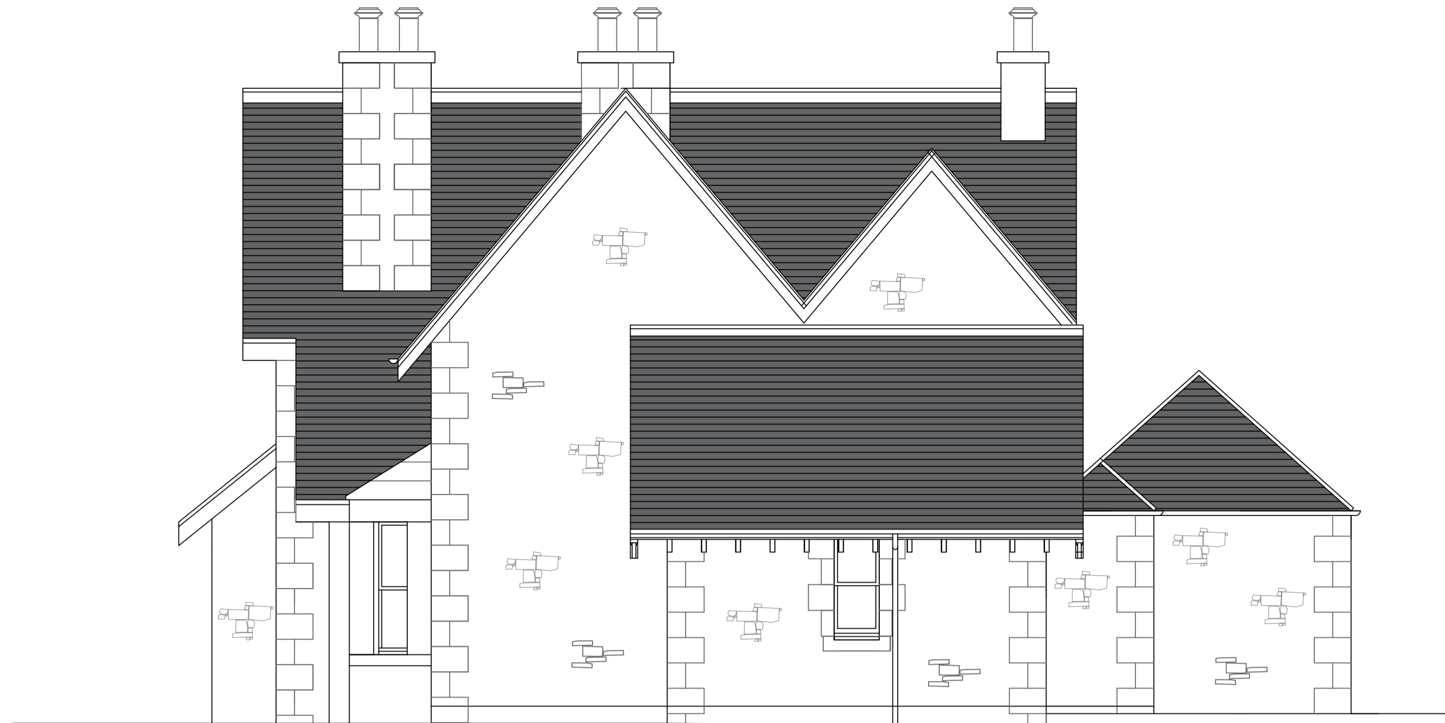
East elevation as existing