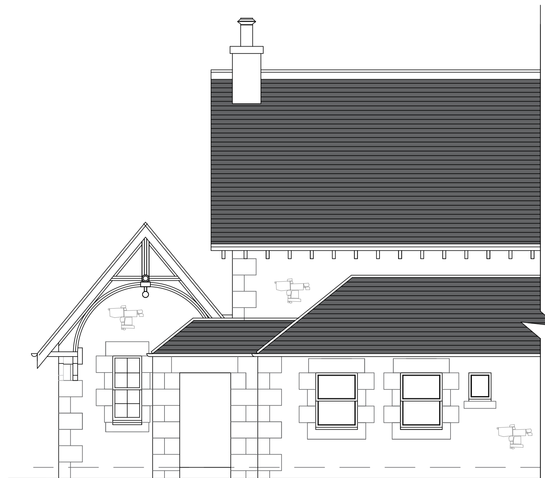
part North elevation as existing

CDM (Construction - Design and Management) 2015