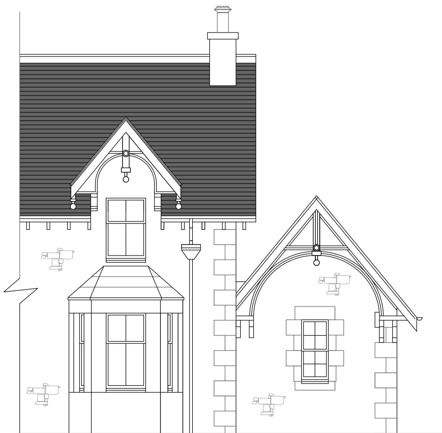
part South elevation as existing