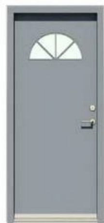
Plain with farmhouse glass