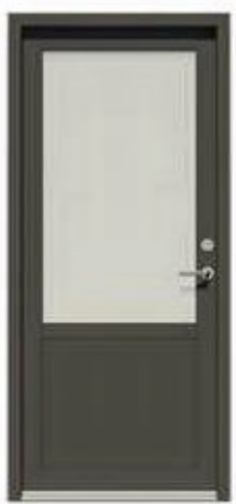
Glazed door with 1 panel