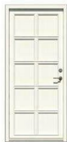
Multi lights door