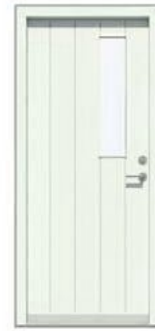
Vertical with small rectangle glass