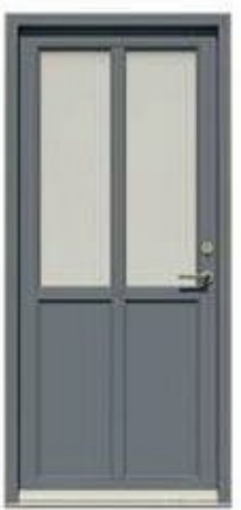
Two top lights and 2 bottom panels