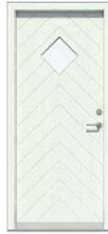
Fishbone with diamond glass