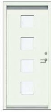
Plain with square multi lights