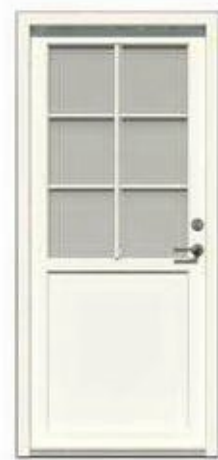
Top multi lights and one bottom panel