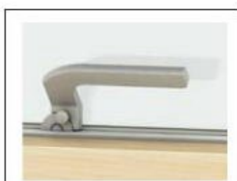
Espagnolette with child-lock