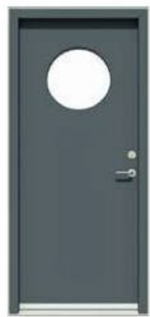
Plain with round glass