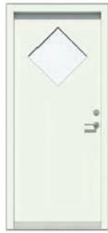
Plain with diamond light