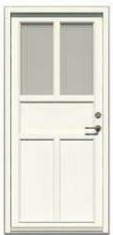
Two top lights and bottom panels