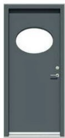
Plain with oval glass