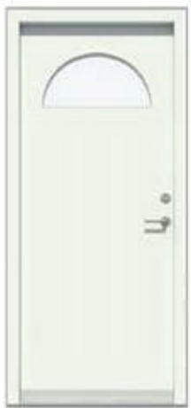
Plain with half round glass