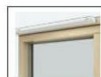
Acoustic trickle vent

The warm and non-slip surface of the maxi-handle makes opening the window easier for those with an infirm grip.