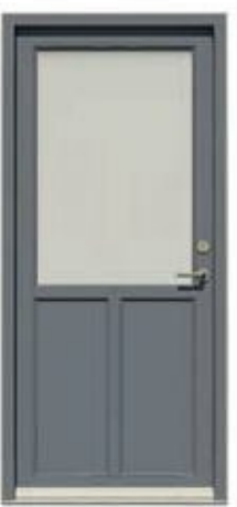
Glazed door with 2 bottom panels