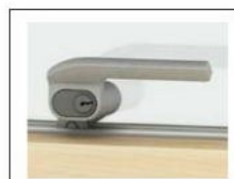
Espagnolette with cylinder lock

All espagnolettes can be supplied with a lock and key for extra security or with a child-lock button.