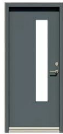
Plain with long rectangle glass and kick plate