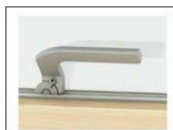
Espagnolette with lock