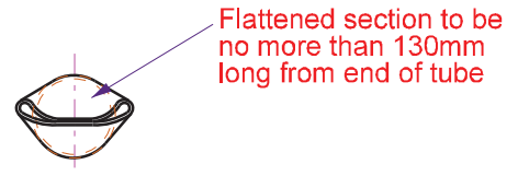
VIEW 'B' SCALE 1:5 @ A4