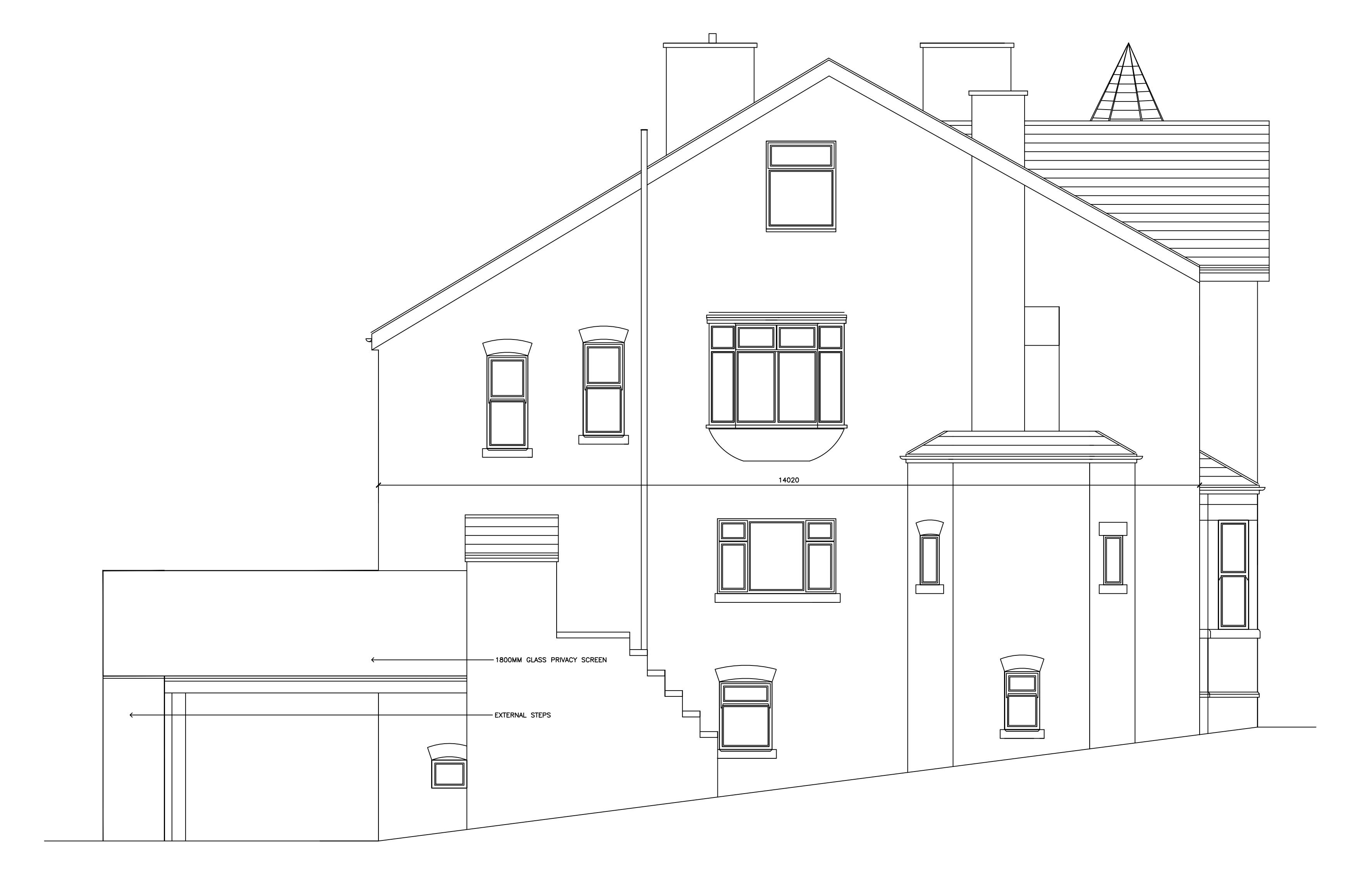
PROPOSED BUILDING SIDE ELEVATION (SCALE 1:50)