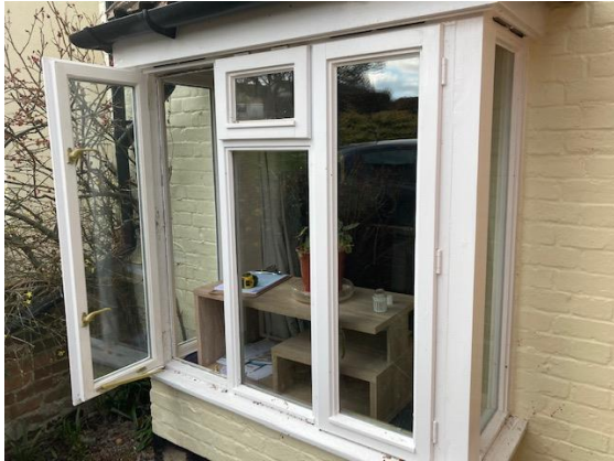
Existing bay windows