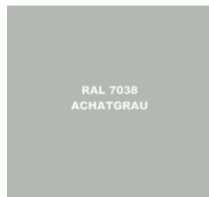
Ral 7038 Painswick

The proposed windows are 'Smart Systems' Aluminium heritage windows, manufactured by Hadleigh Glass Ltd. The external colour required is 'Painswick Grey' which is RAL 7038