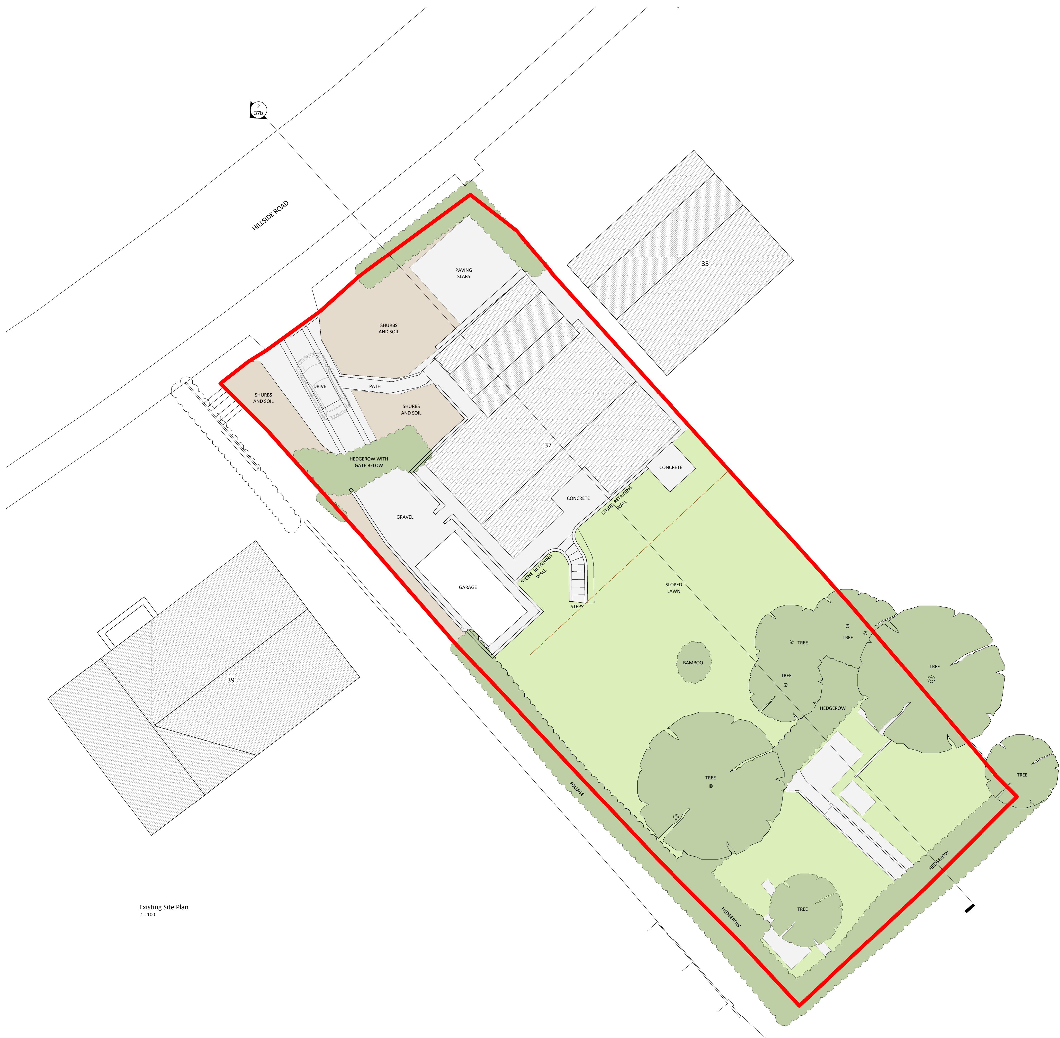
Existing Site Plan 1:100