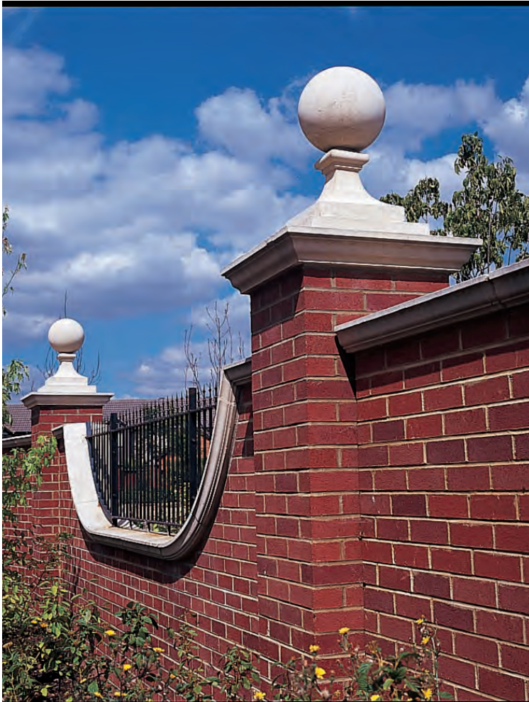
13" Ball & Collared Base (see p77), Block S140B, Cap S130 & Coping T150.