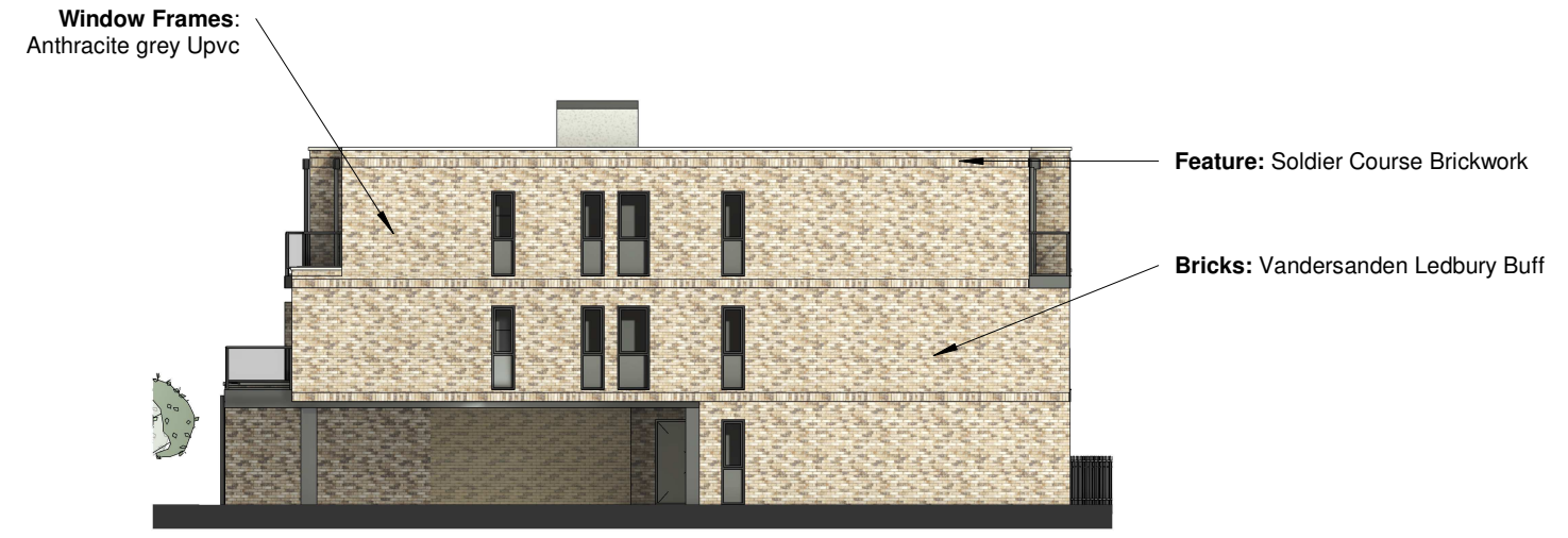
PROPOSED FLANK ELEVATION - SOUTH-EAST