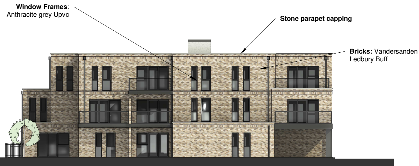
PROPOSED REAR ELEVATION - SOUTH-WEST