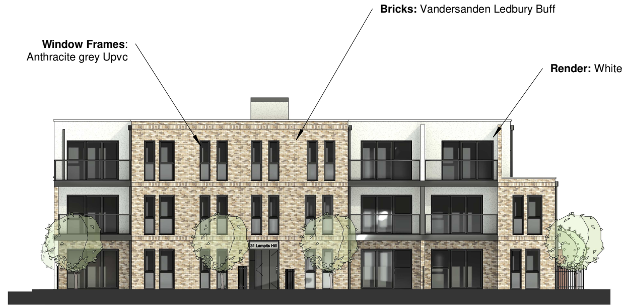
PROPOSED FRONT ELEVATION - NORTH-EAST (LAMPITS HILL)