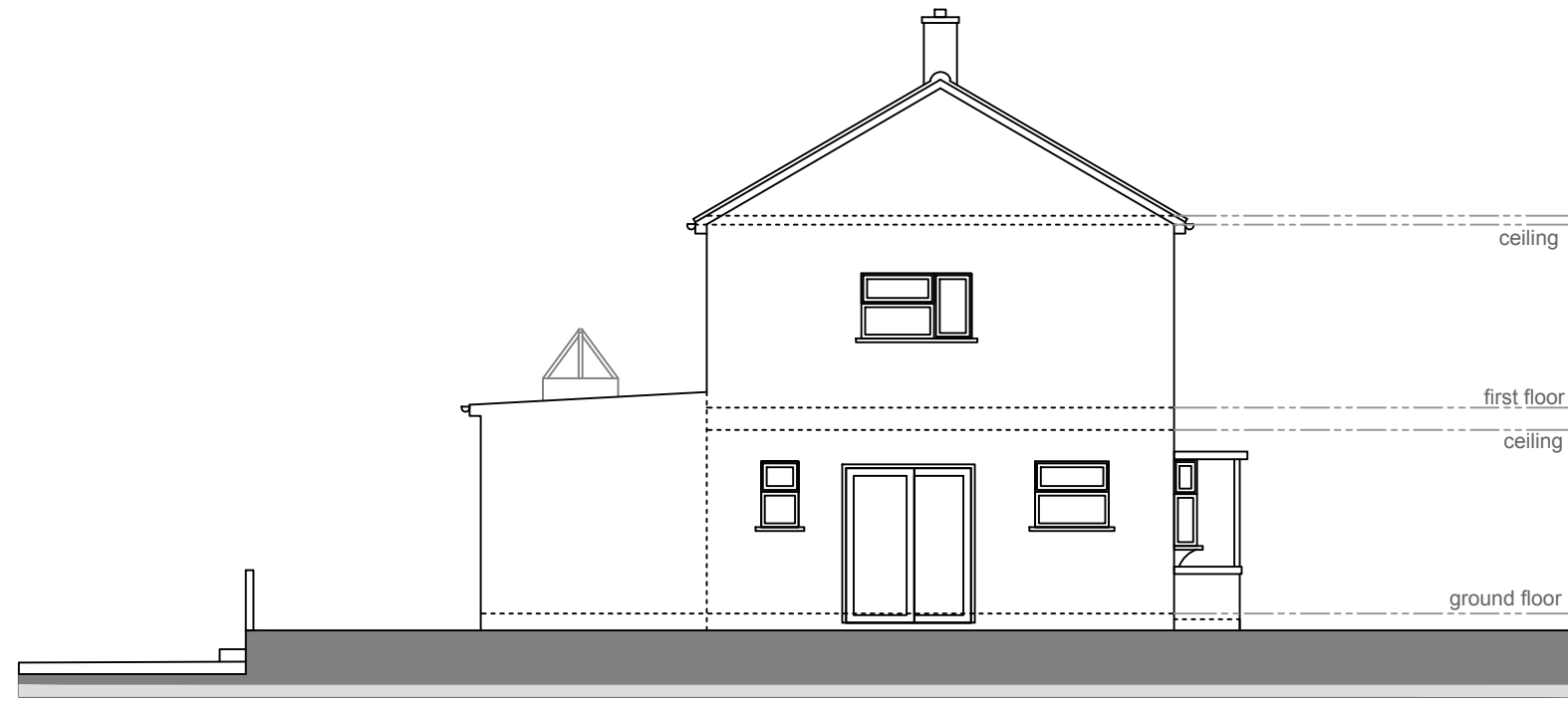
11 L.H SIDE ELEVATION - EXISTING 1:100