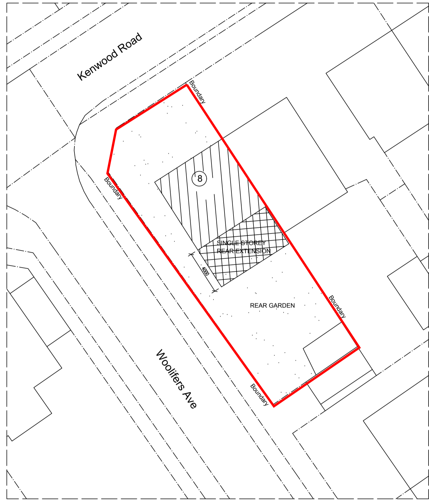
PROPOSED SITE PLAN scale 1:200