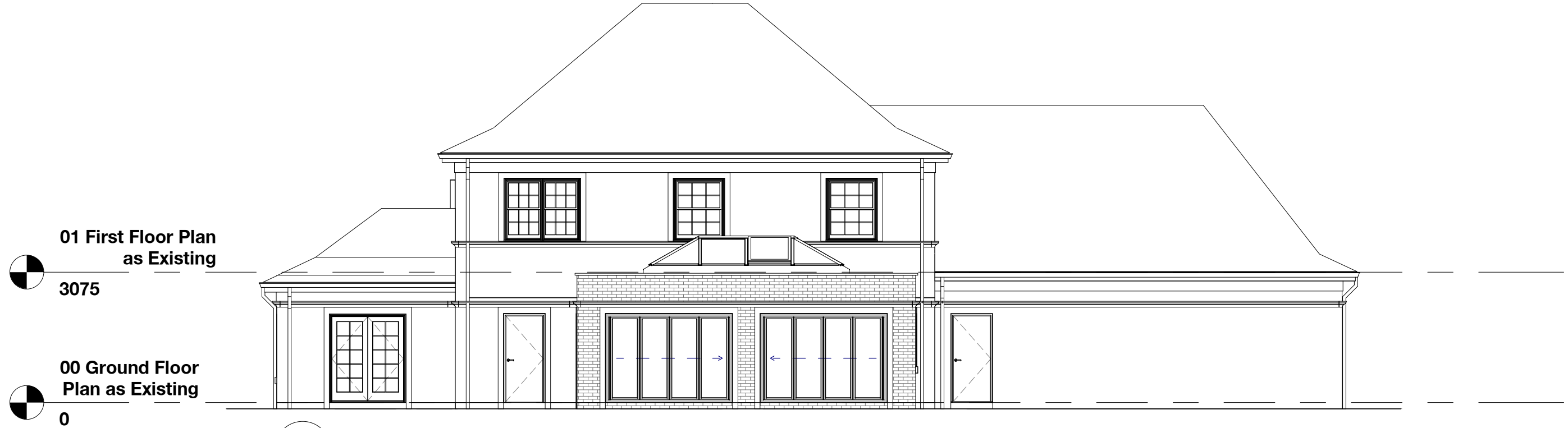
1 South Elevation as Proposed 1 : 100

EXTERNAL WALLS - to be finished in facing brickwork to match existing, all to be approved in writing by the Local Planning Department. FLAT ROOF - to be finished in grey GRP, all to be approved in writing by the Local Planning Department. FENESTRATION - Aluminium framed powder coated doors and lantern with solar reflective glazing, together with uPVC windows to match existing. RAINWATER GOODS - uPVC to match existing. FOUL WATER - to be discharged to the existing foul water drainage system. SURFACE WATER - to be discharged to existing surface water drainage system.