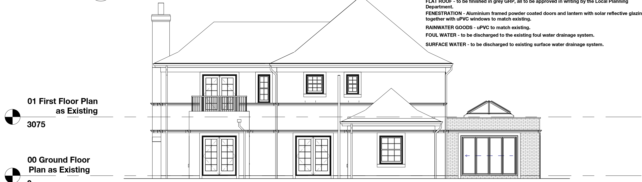
2 West Elevation as Proposed 1 : 100

EXTERNAL WALLS - to be finished in facing brickwork to match existing, all to be approved in writing by the Local Planning Department. FLAT ROOF - to be finished in grey GRP, all to be approved in writing by the Local Planning Department. FENESTRATION - Aluminium framed powder coated doors and lantern with solar reflective glazing, together with uPVC windows to match existing. RAINWATER GOODS - uPVC to match existing. FOUL WATER - to be discharged to the existing foul water drainage system. SURFACE WATER - to be discharged to existing surface water drainage system.