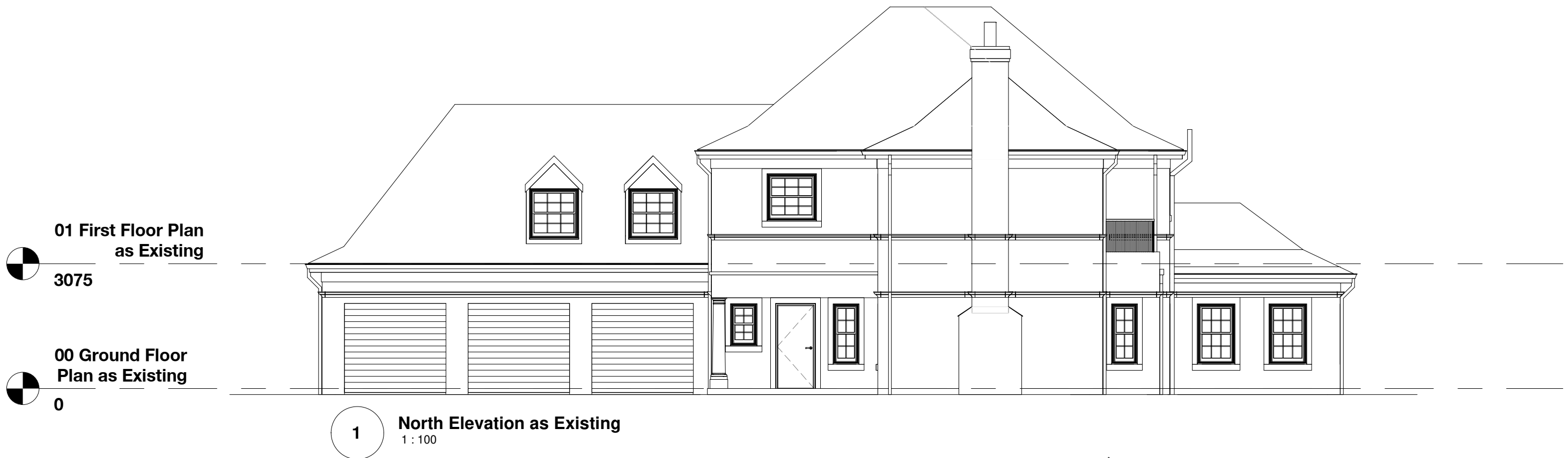
1 North Elevation as Existing 1 : 100