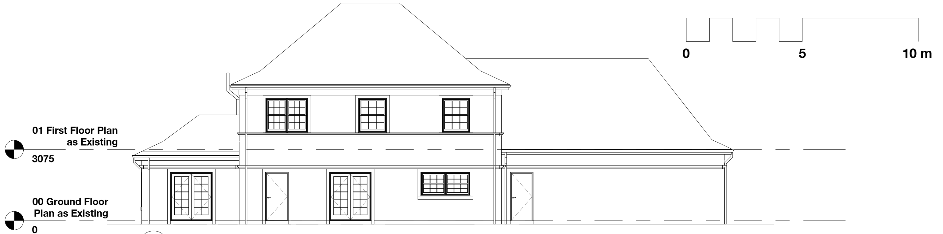
1 South Elevation as Existing 1 : 100