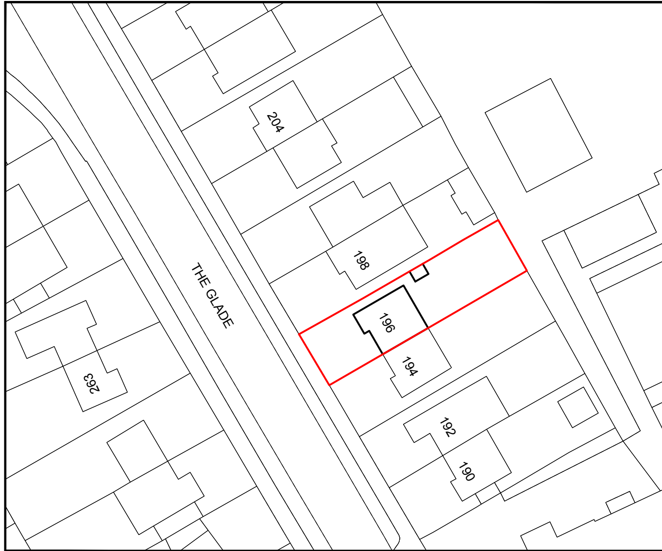
Existing Block Plan Scale 1:500