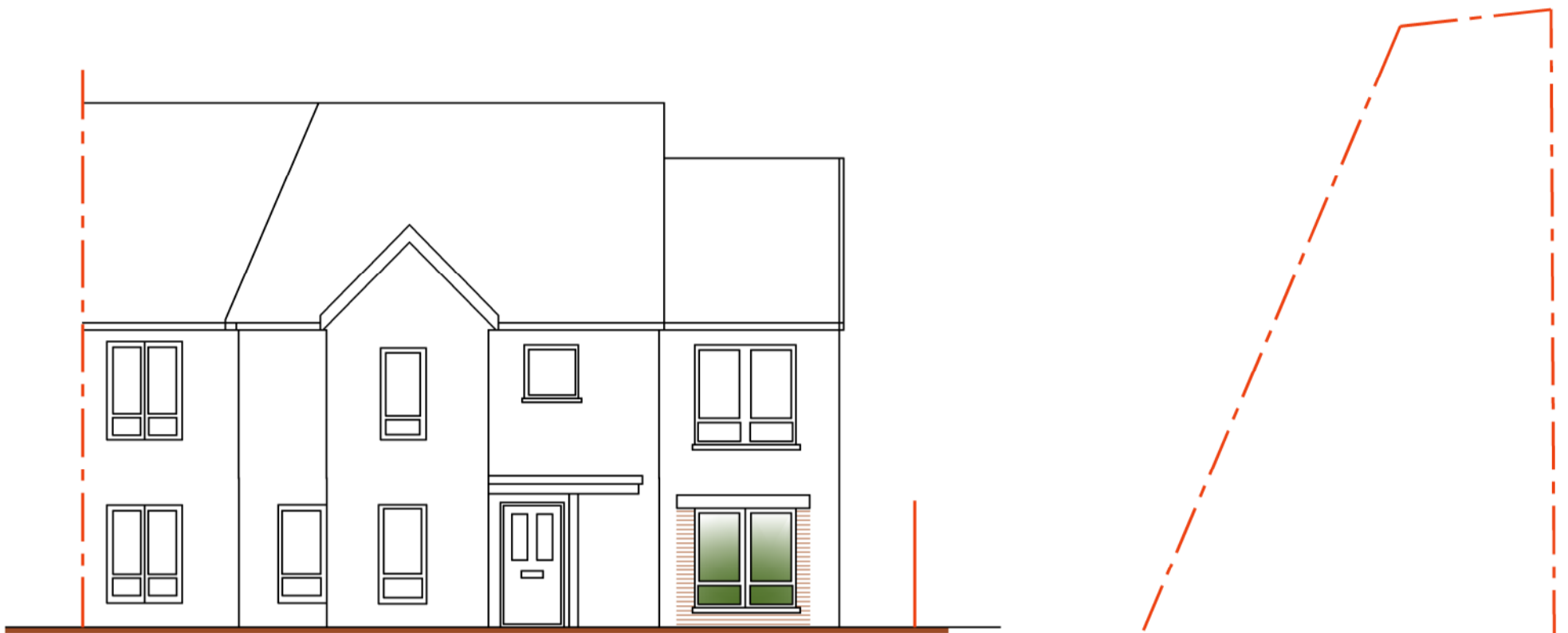
PROPOSED FRONT ELEVATION 1:100@A3