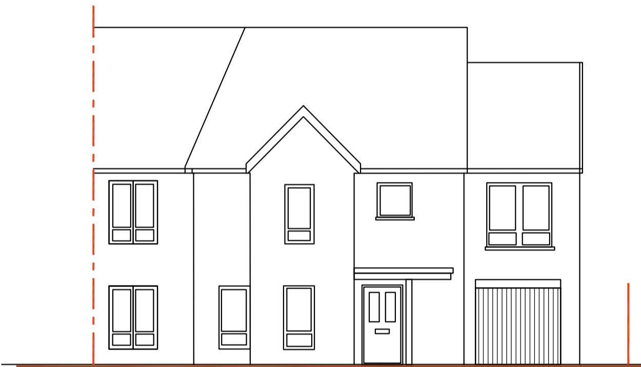
EXISTING FRONT ELEVATION 1:100@A3