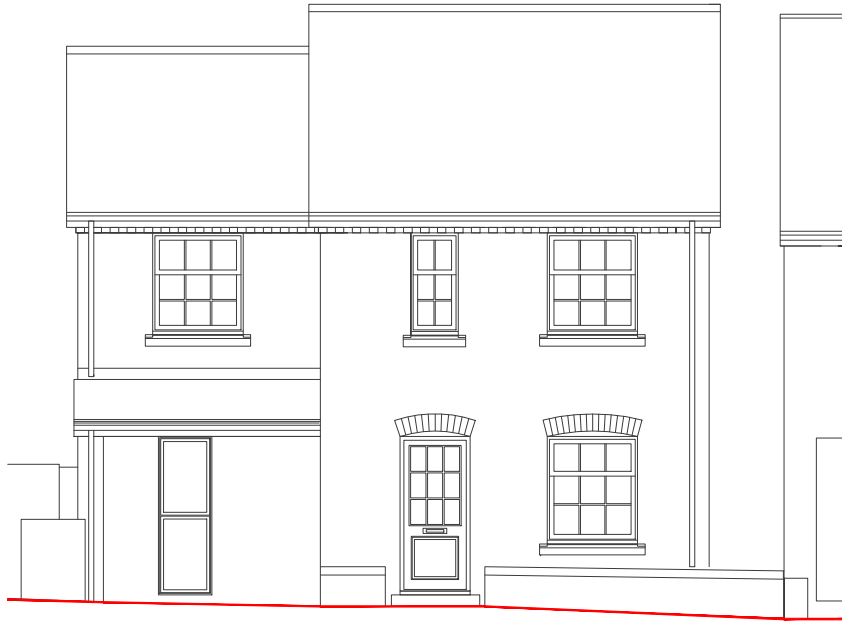
Proposed Front Elevation 1:100

Notes: This drawing and the building works depicted is the property and copyright of the designer and written consent must be obtained before divulging to a third party or copying whole or part of the drawing by any method whatsoever. The contractor is to check and verify all building and site dimensions, levels and sewer invert levels at connection points and all discrepancies reported to the Architect before work commences. The drawing must be read in conjunction with and checked against any relevant structural or other Specialist drawings provided. Dimensions are in Millimeters. All our proposals are subject to confirmation following liaison with the relevant local authority. These drawings have been prepared for the sole use of accompanying a Planning Application ONLY and should not be used for any other purposes. The designer accepts no responsibility for their use for any other purpose.