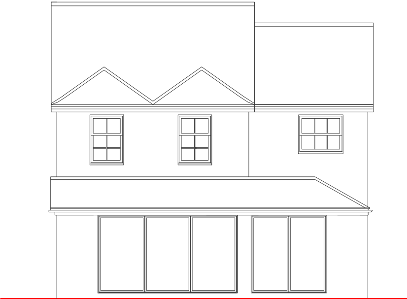
Proposed Rear Elevation (garage hidden) 1:100