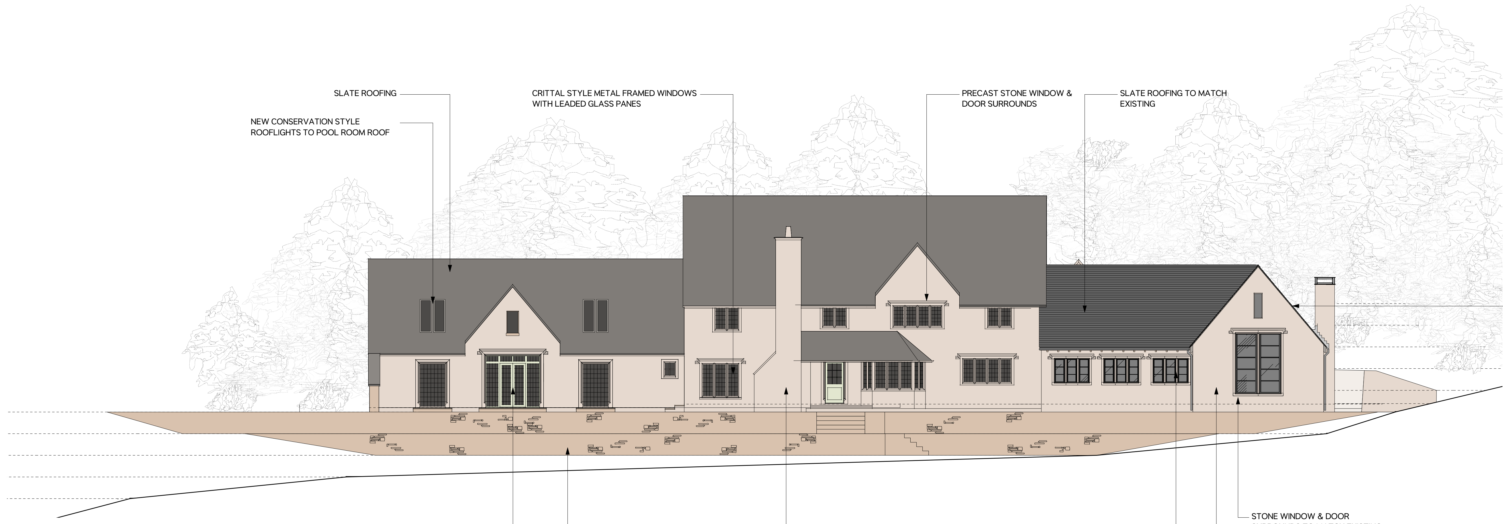
01 PROPOSED NON MATERIAL AMENDMENT SOUTH FACING ELEVATION 1:100 @ A1 / 1:200 @ A3

1 Drawing must be printed at 100% on Standard Paper size noted in title block to ensure accuracy. 2 Any discrepancies to be referred to the Architect. 3 This drawing is to be read in conjunction with all relevant Specifications and other drawings issued by the Architect, Structural Engineer and other Consultants or Specialists. 4 This drawing is copyright and is not to be reproduced in part or whole without prior expressed permission of ERRAND Studio.