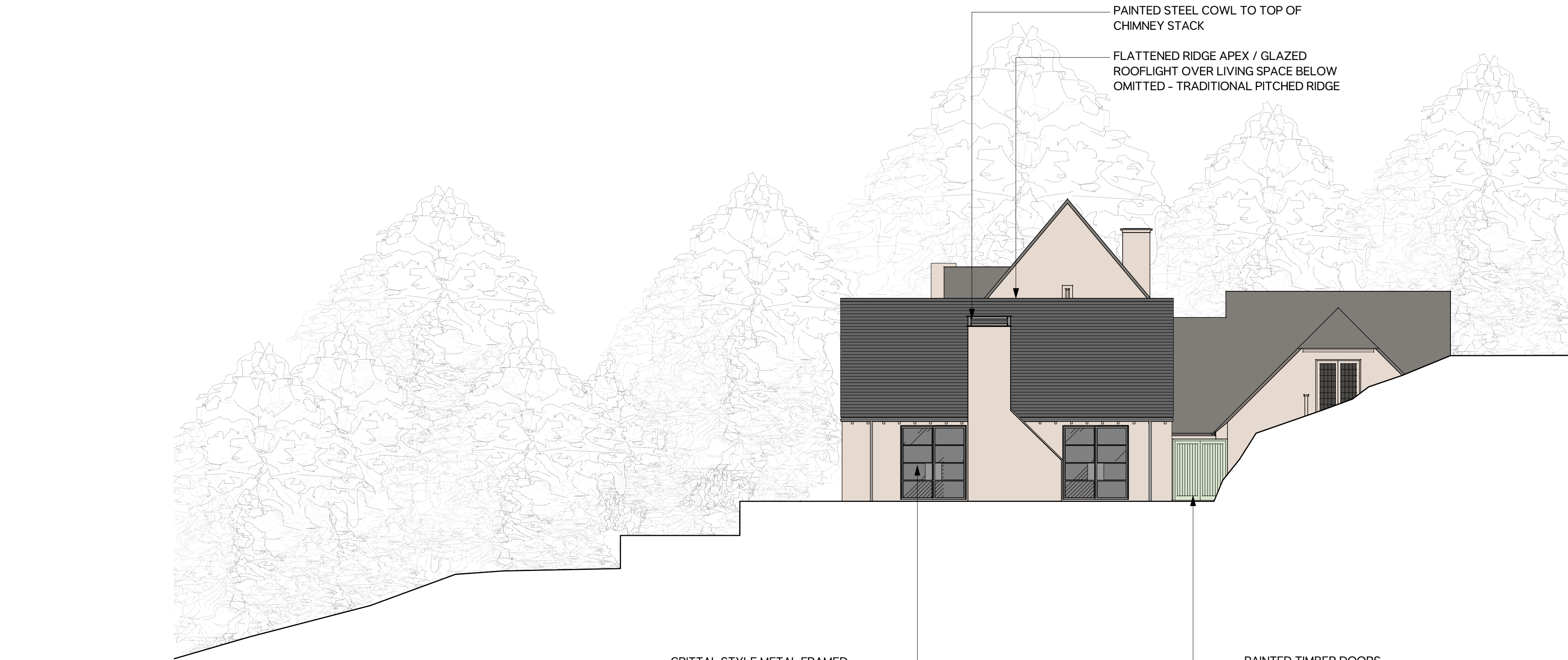
02 PROPOSED NON MATERIAL AMENDMENT EAST FACING ELEVATION 1:100 @ A1 / 1:200 @ A3

SLATE ROOFING NEW CONSERVATION STYLE ROOFLIGHTS TO POOL ROOM ROOF CRITTAL STYLE METAL FRAMED WINDOWS WITH LEADED GLASS PANES PRECAST STONE WINDOW & DOOR SURROUNDS SLATE ROOFING TO MATCH EXISTING PITCH OF NEW ROOF FORMS TO MATCH EXISTING TO ENSURE HARMONIOUS RELATIONSHIP TO ORIGINAL DWELLING PARAPET GABLED END REVERTED BACK TO BEDDED MORTAR VERGE DETAIL TO MATCH EXISTING HOUSE PAINTED TIMBER DOORS WITH LEADED GLASS PANES COTSWOLD STONE WALLING FORMING TERRACED LANDSCAPED GARDENS BRADSTONE WEATHERED COTSWOLD COURSED STONE WALLING CRITTAL STYLE METAL FRAMED WINDOWS & DOORS TO MATCH EXISTING BRADSTONE WEATHERED COTSWOLD COURSED STONE WALLING TO NEW EXTENSION TO MATCH EXISTING BUILDING STONE WINDOW & DOOR SURROUNDS TO MATCH EXISTING