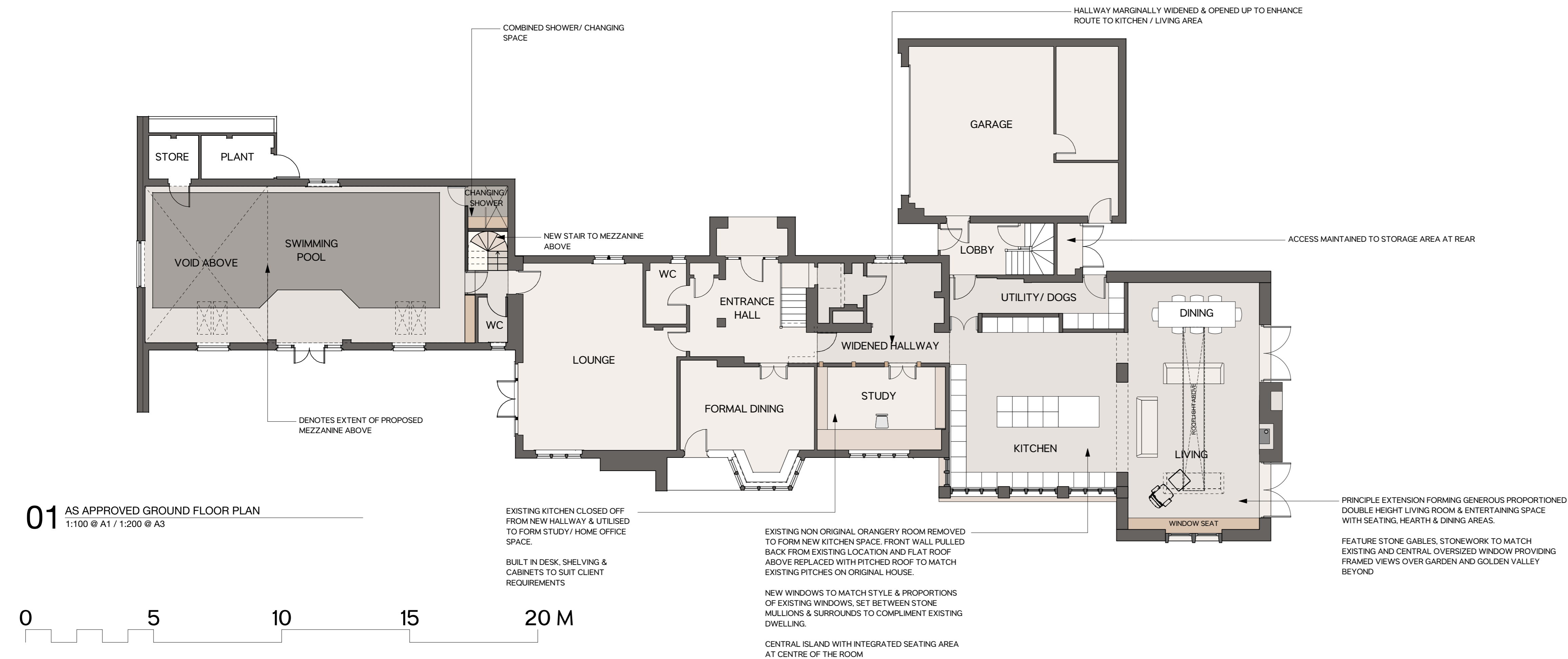
01 AS APPROVED GROUND FLOOR PLAN 1:100 @ A1 / 1:200 @ A3