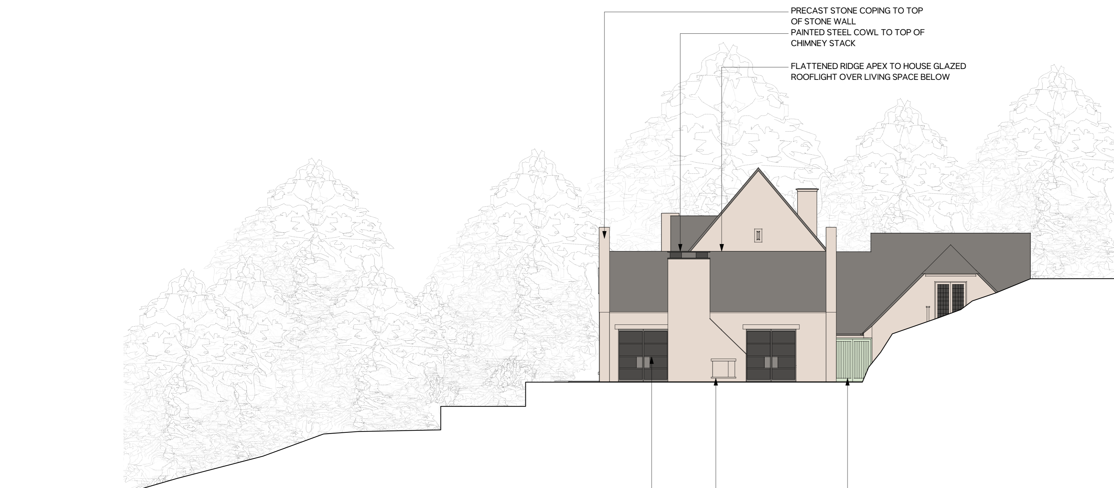
02 AS APPROVED EAST FACING ELEVATION 1:100 @ A1 / 1:200 @ A3