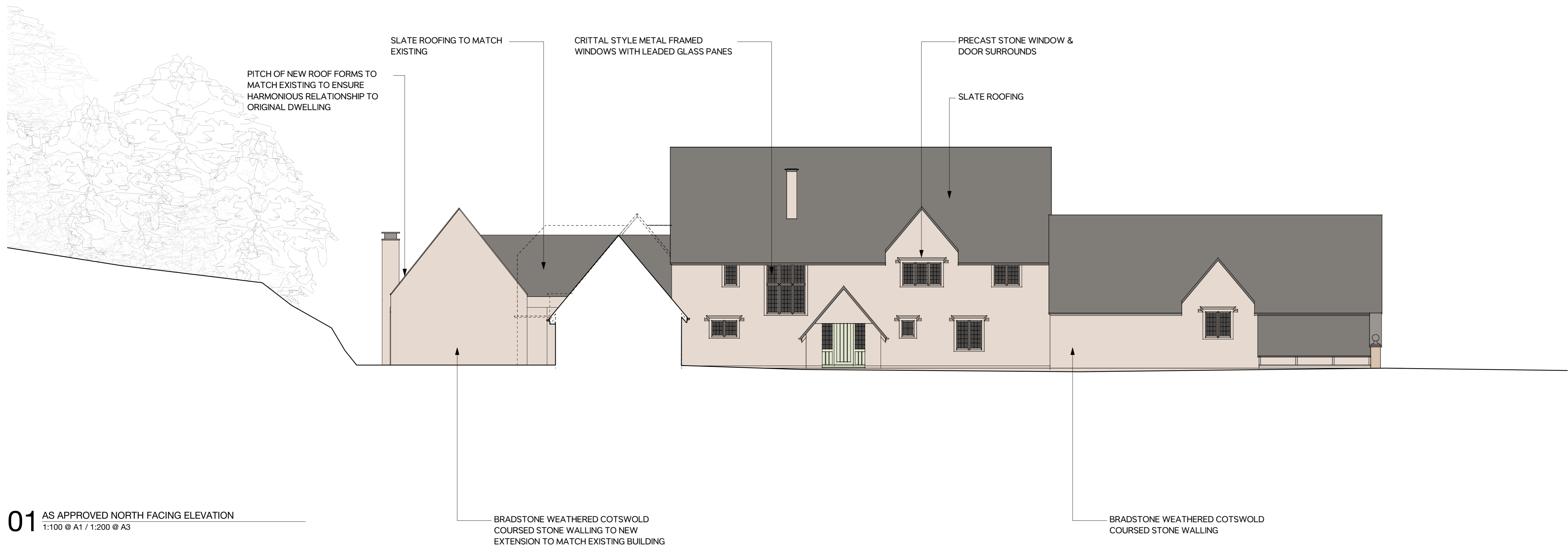
01 AS APPROVED NORTH FACING ELEVATION 1:100 @ A1 / 1:200 @ A3