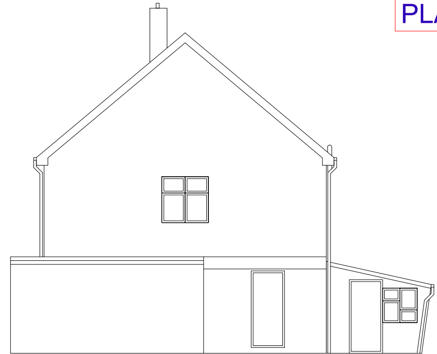
Existing Side (North) Elevation