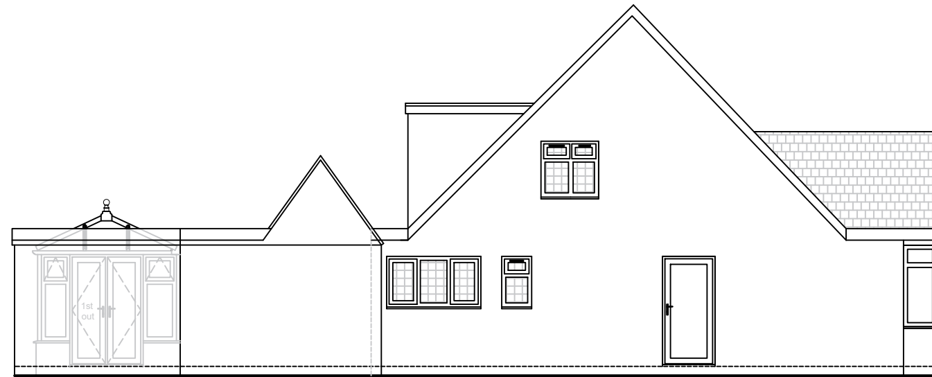
LEFT HAND SIDE ELEVATION

Overall double door walk-through 1182mm, primary door walk-through 556mm. These are approximate sizes.