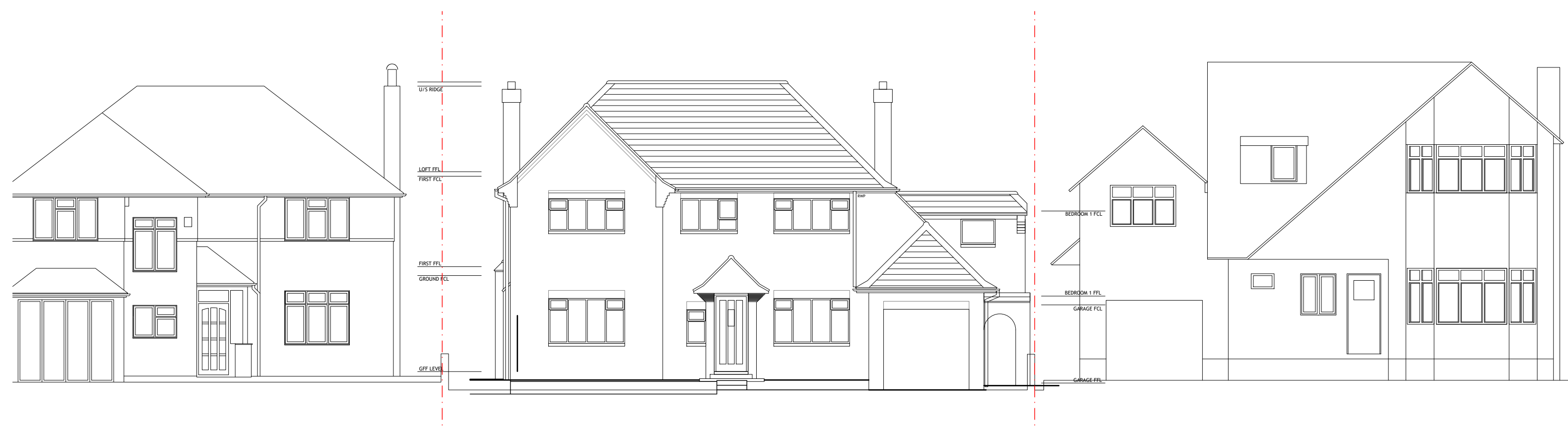
EXISTING: STREET SCENE