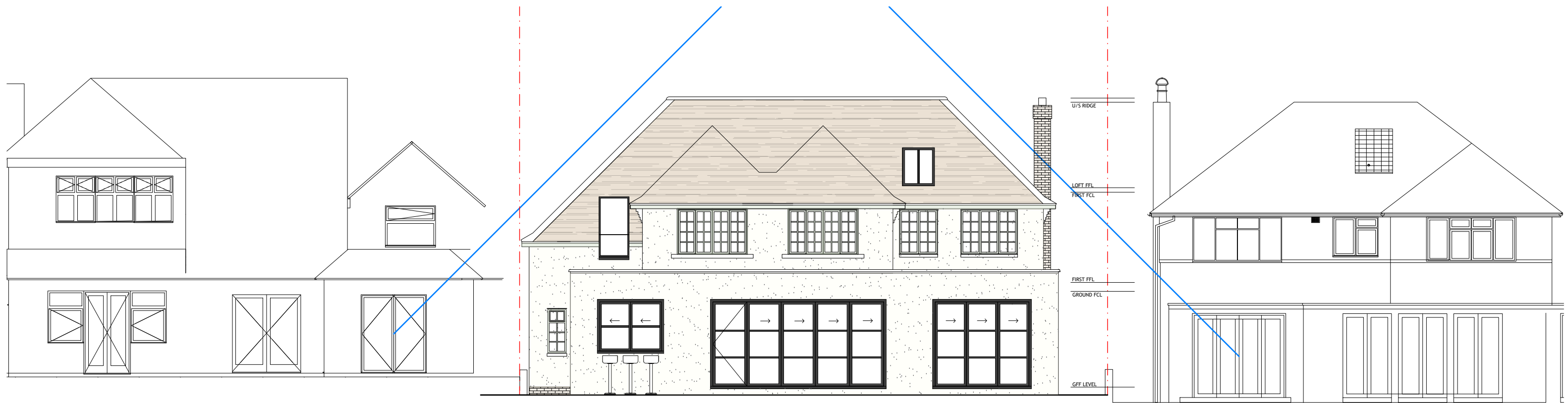
PROPOSED: STREET SCENE