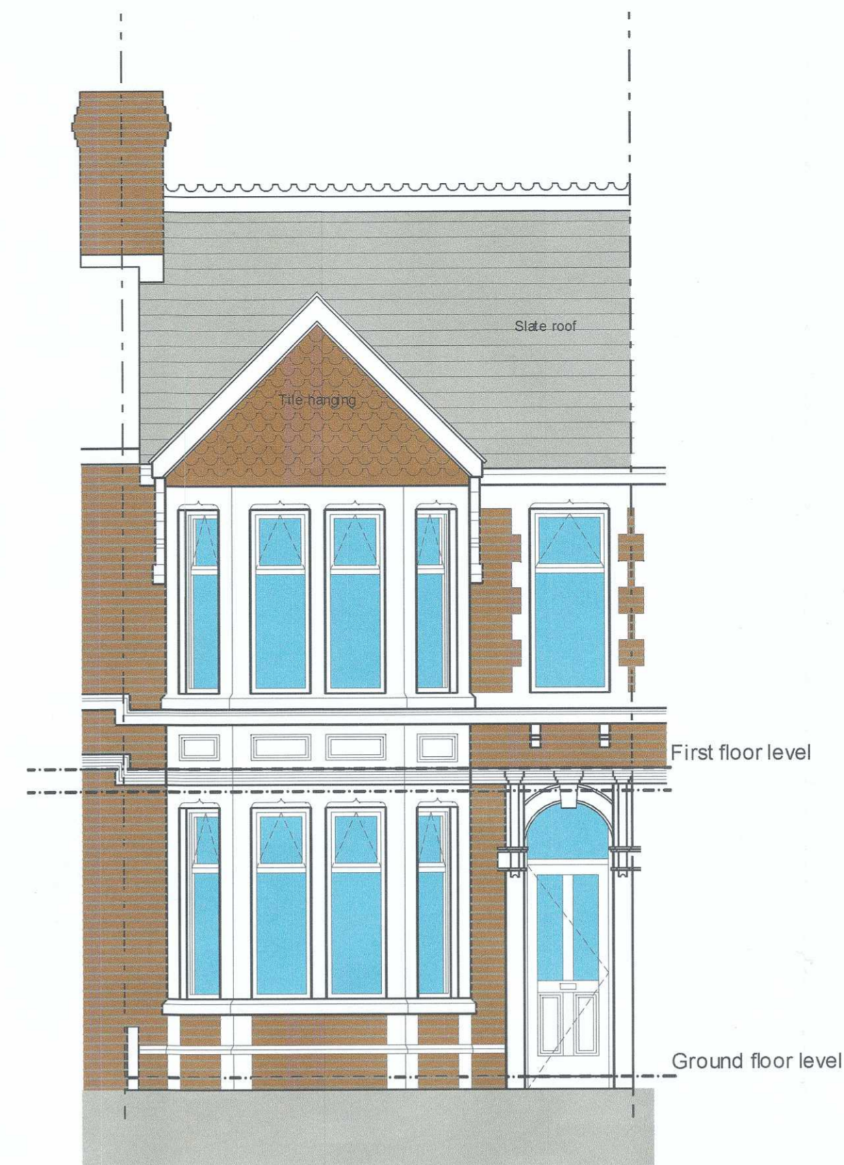
FRONT ELEVATION: ..... East Elevation ..... Facing the main Edington Avenue Scale 1:50