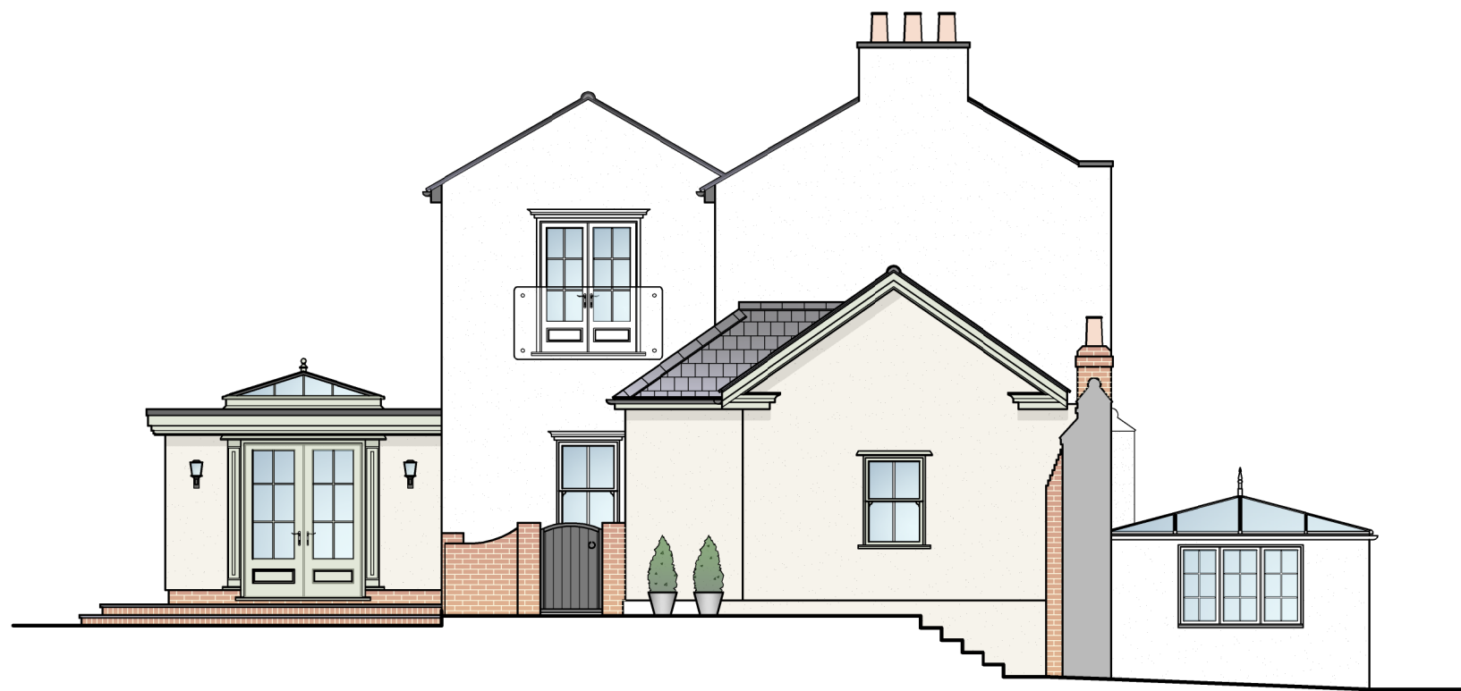
Proposed Side Elevation 1:100