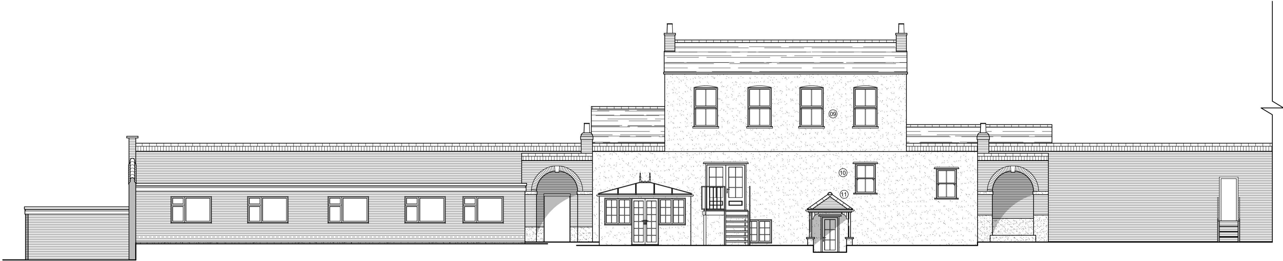
Proposed Rear Elevation 1:100