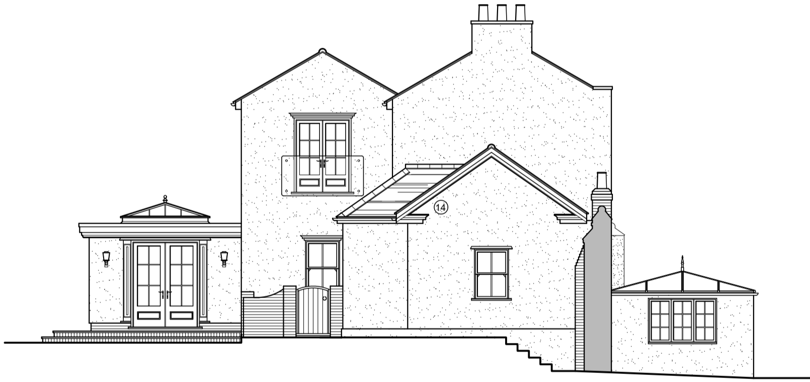
Proposed Side Elevation 1:100