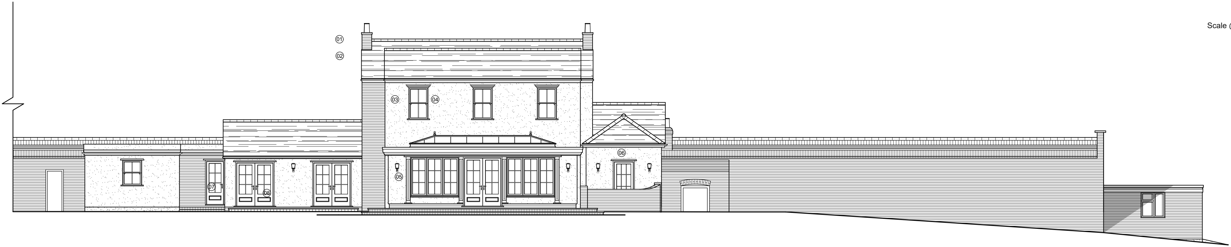
Proposed Front Elevation 1:100