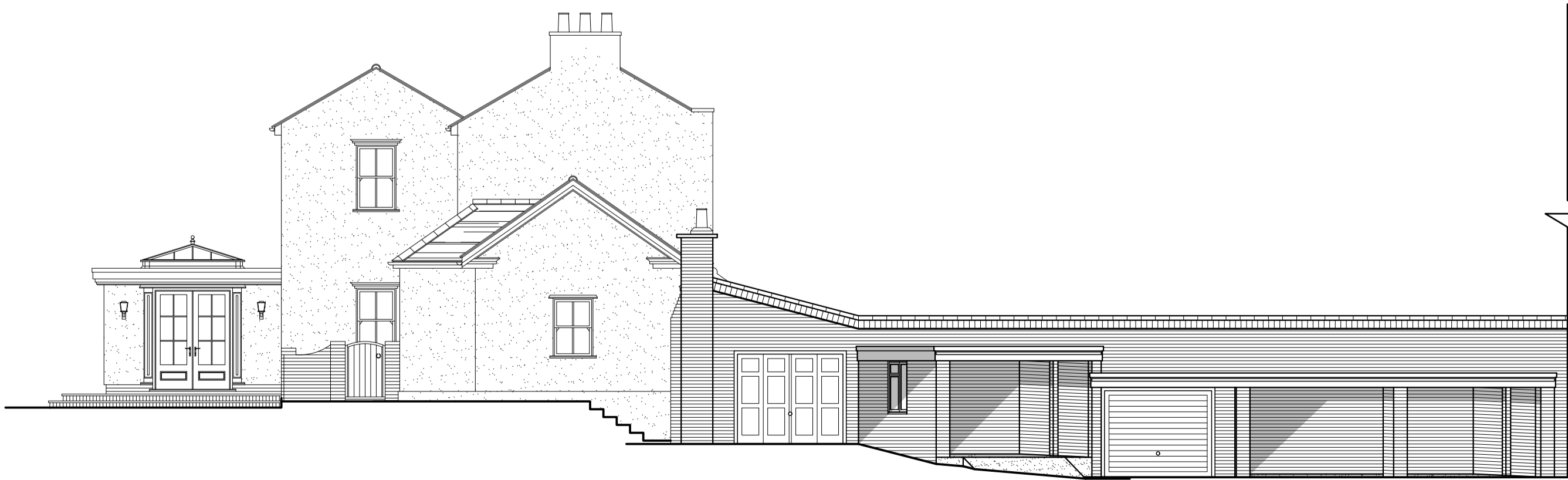
Proposed Side Elevation (Showing Garage units) 1:100