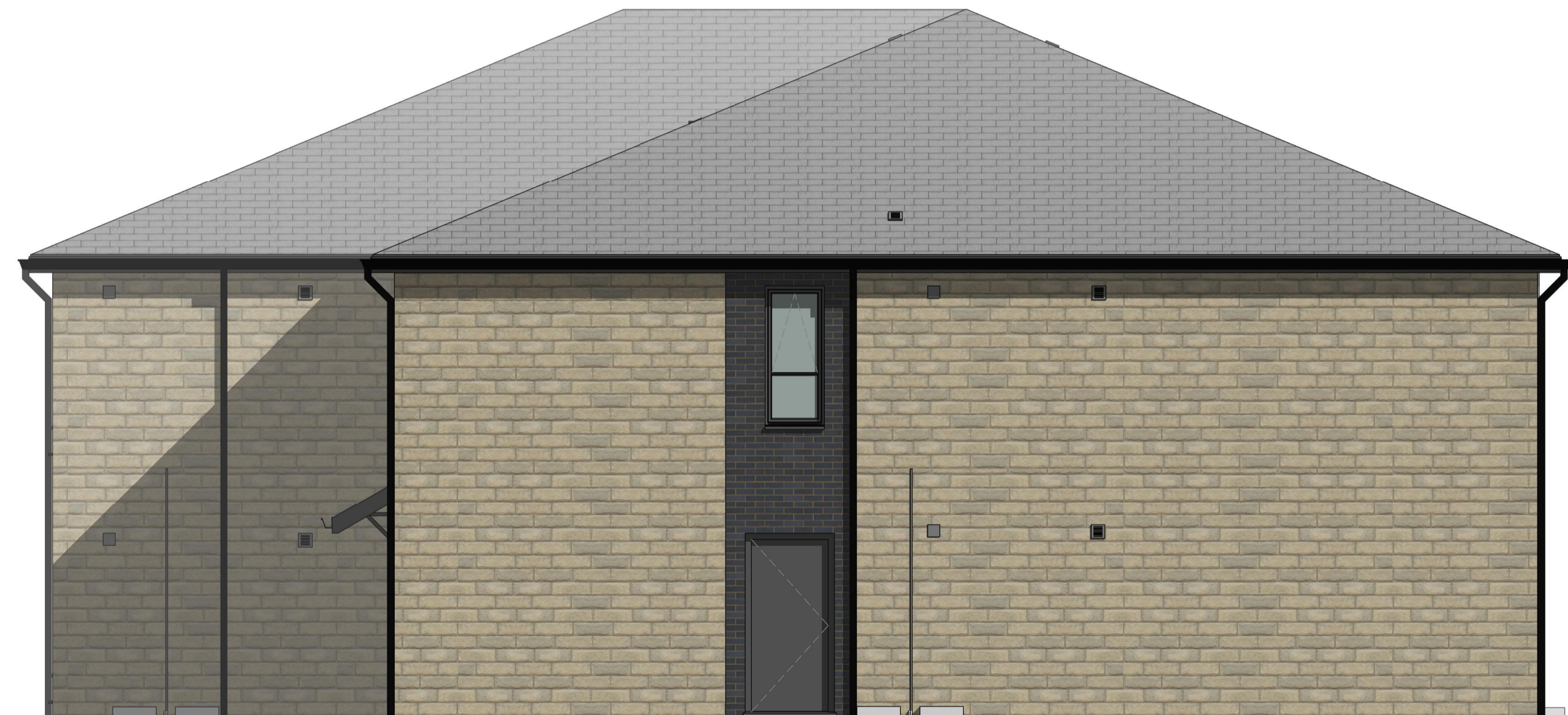
04 Gable Elevation B