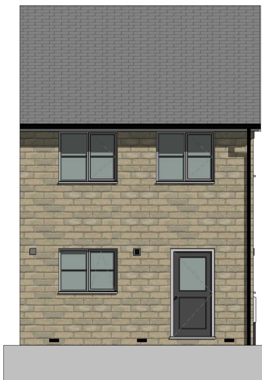
Rear Elevation 1 : 50