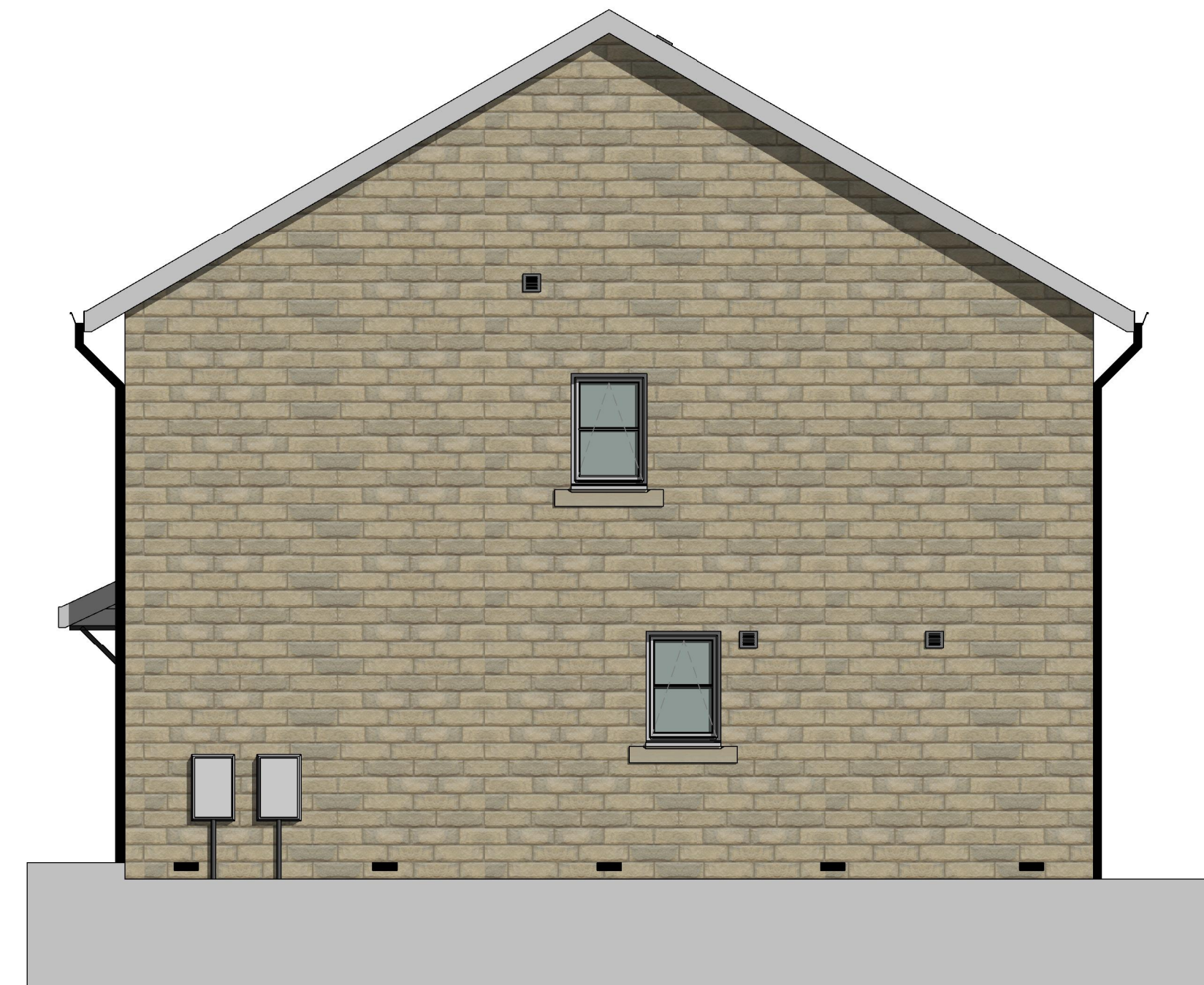
Gable Elevation 2 1 : 50