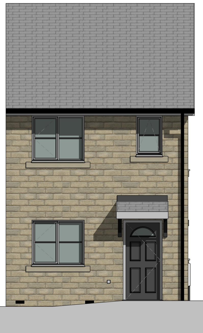
Front Elevation 1 : 50