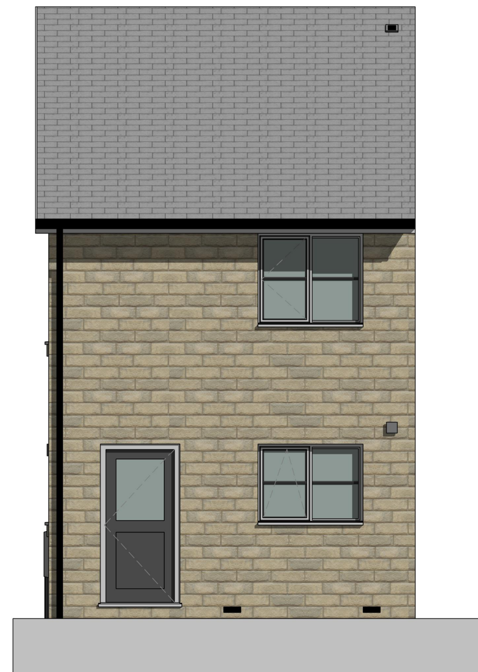
Rear Elevation 1 : 50