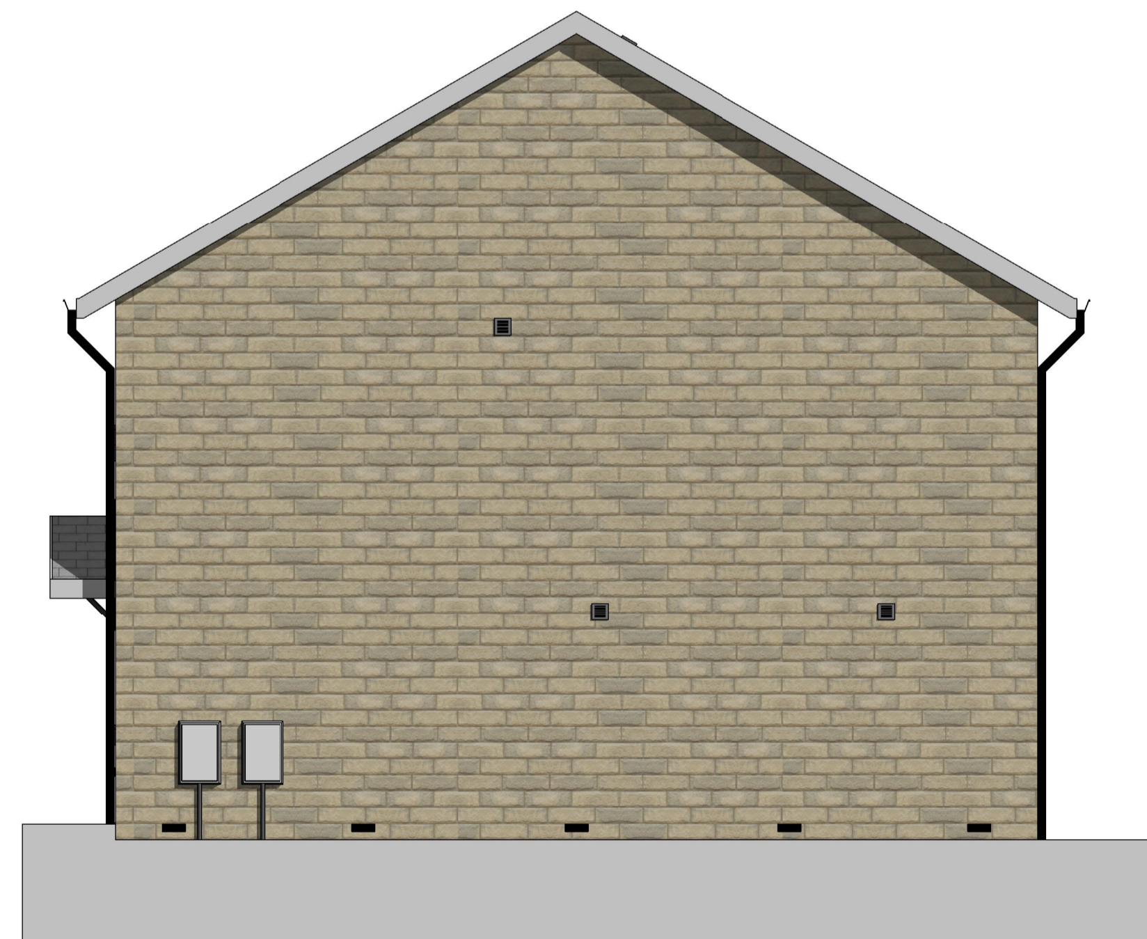
Gable Elevation 2 1 : 50