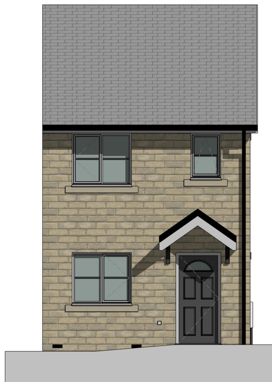
Front Elevation 1 : 50