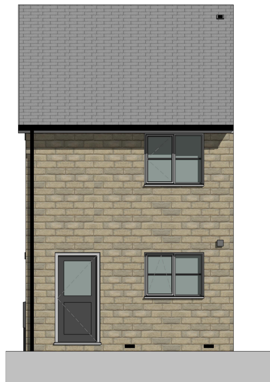
Rear Elevation 1 : 50