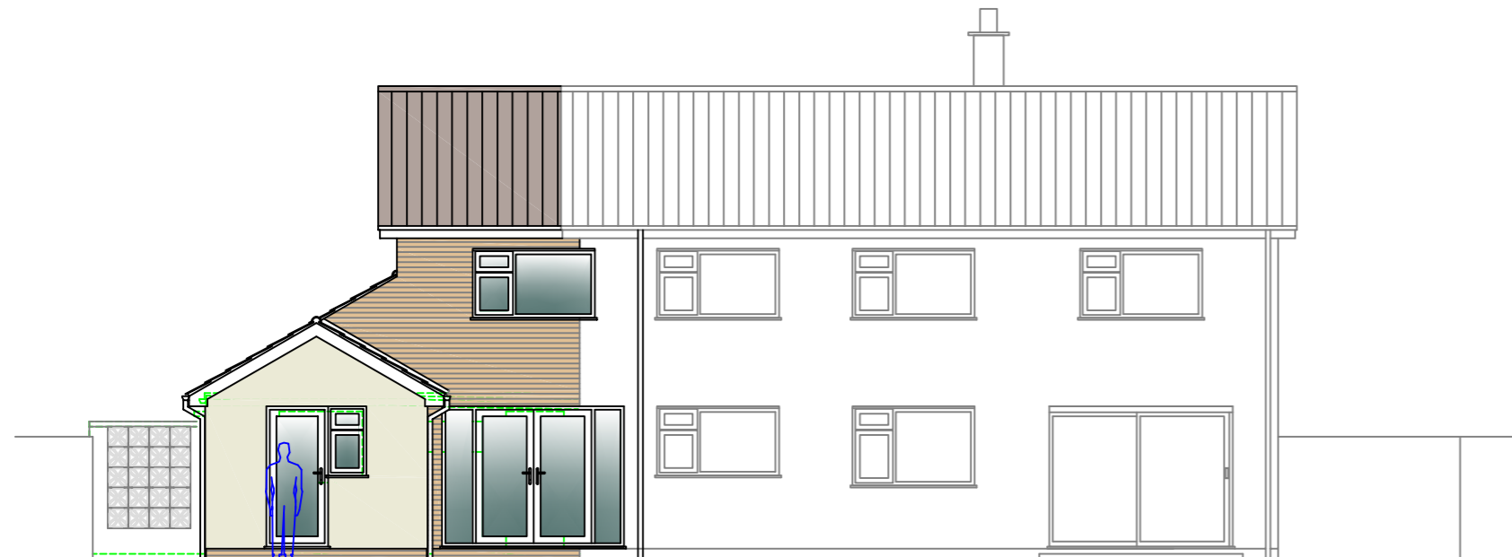
South (Rear) Elevation