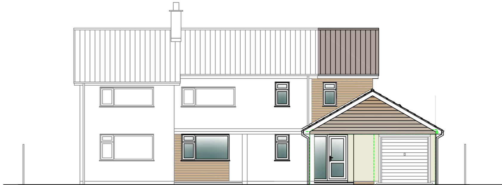
North (Front) Elevation