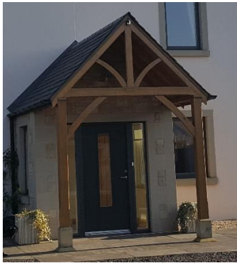
Oak framed porch to principle entrance as indicated