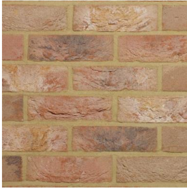
Facing brick with mortar to match render finish