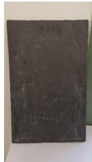
natural slate roof finish – Cupa-H Spanish slates