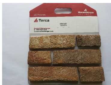
facing brickwork walls – Kempley Antique