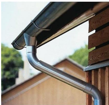
lindab rainwater goods finished in Galvanised steel