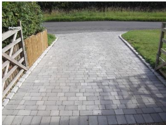
charcoal coloured paviors – pavedrive by Stonemarket or similar approved