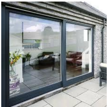
composite sliding doors, external colour Sage Green as indicated on drawings