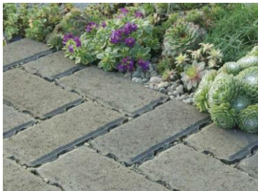
charcoal coloured paviors – pavedrive by Stonemarket