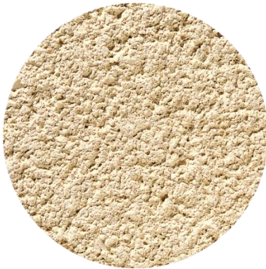
Buttermilk coloured K-render