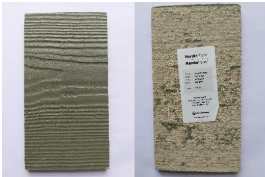
HardiePlank Fibre Cement Boarding in Mountain Sage to be fixed horizontally