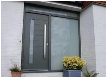
composite door (principle entrance door), external colour Sage Green as indicated on drawings