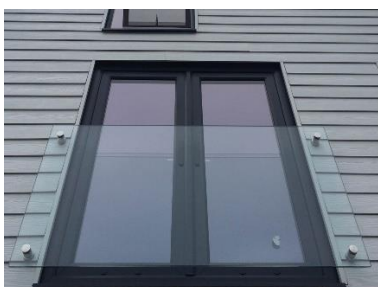
infinitely glazed Juliette balcony