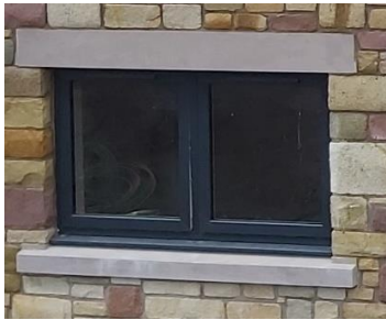
composite windows, external colour Sage Green by approved manufacturer to style indicated on drawings