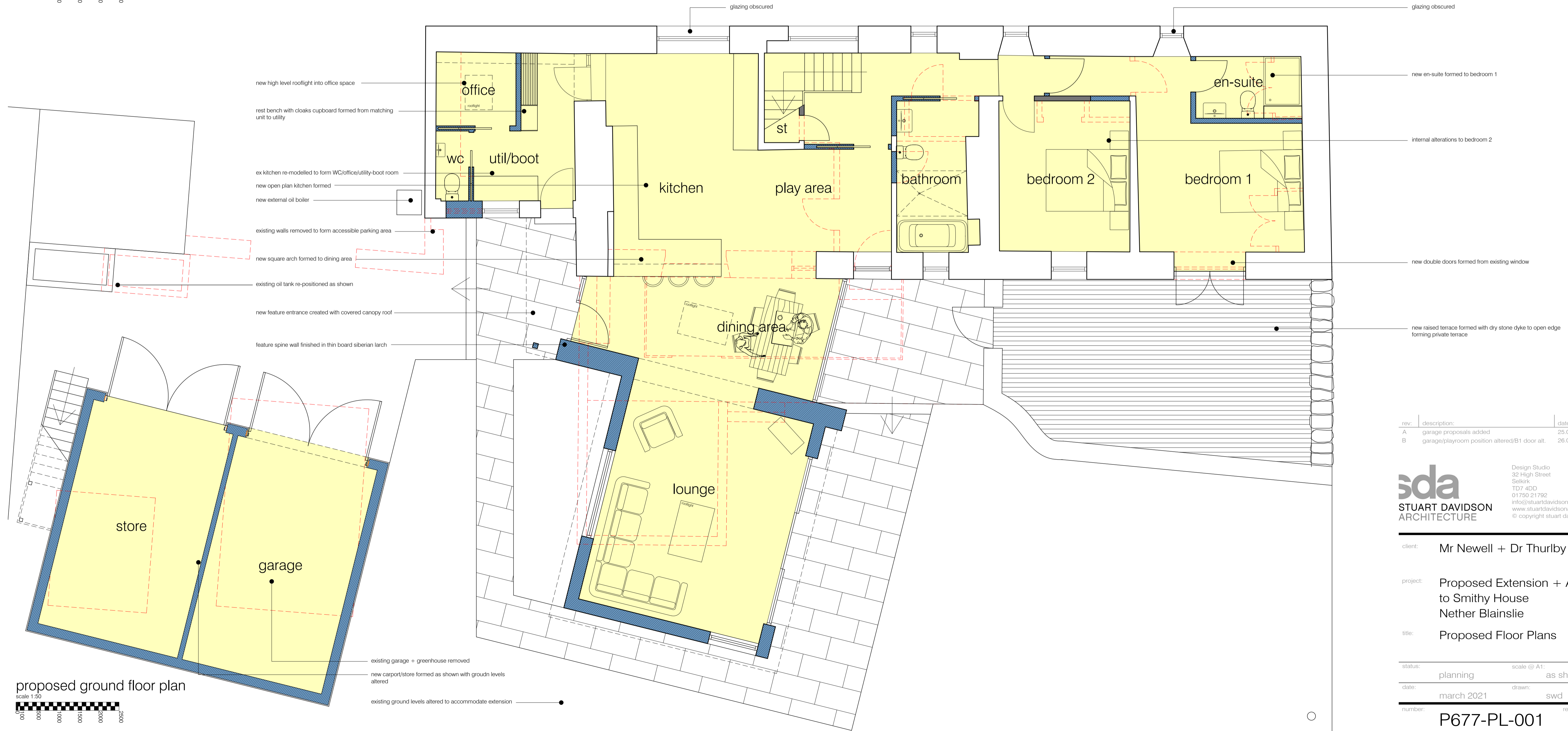
proposed ground floor plan