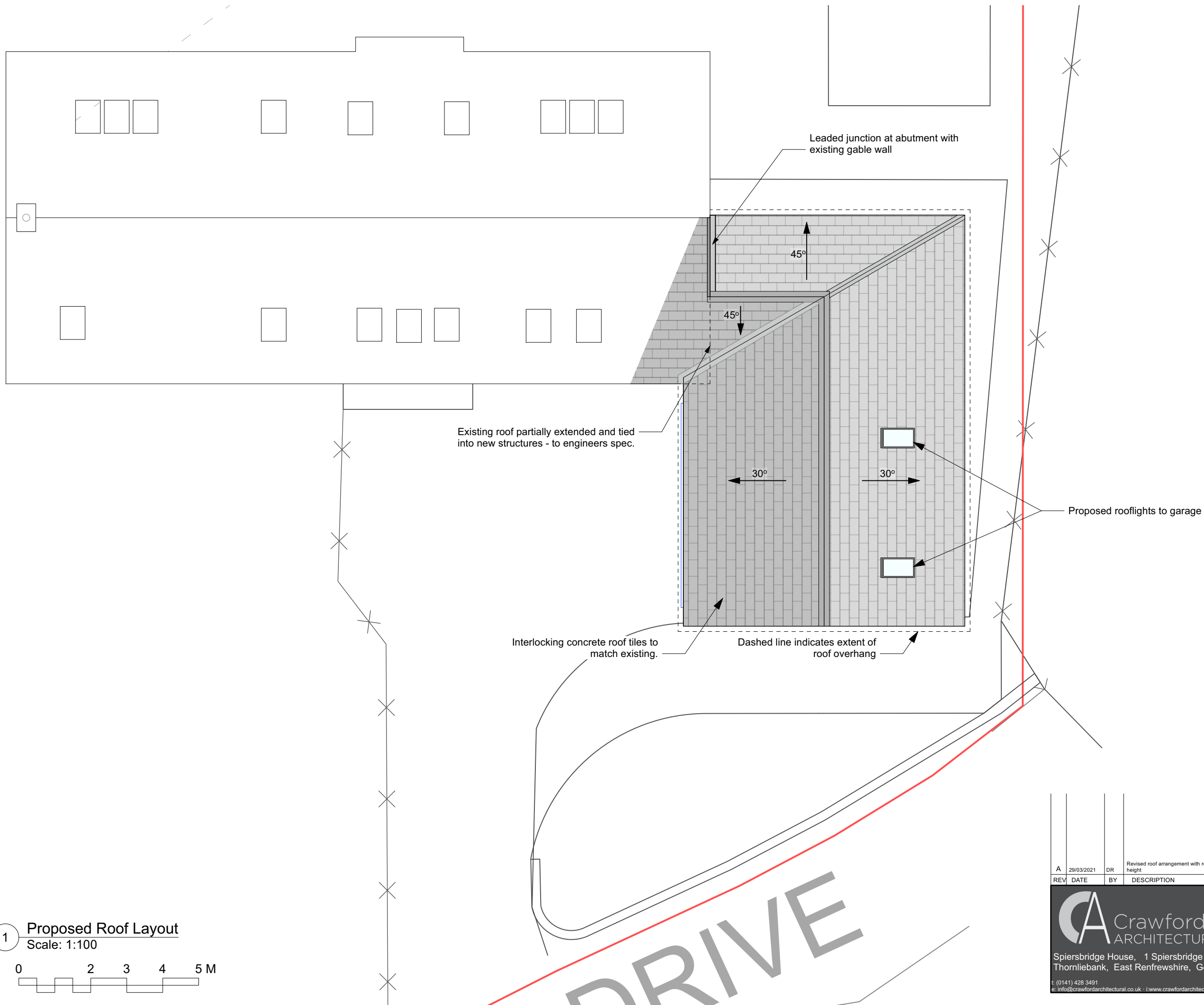
1 Proposed Roof Layout Scale: 1:100