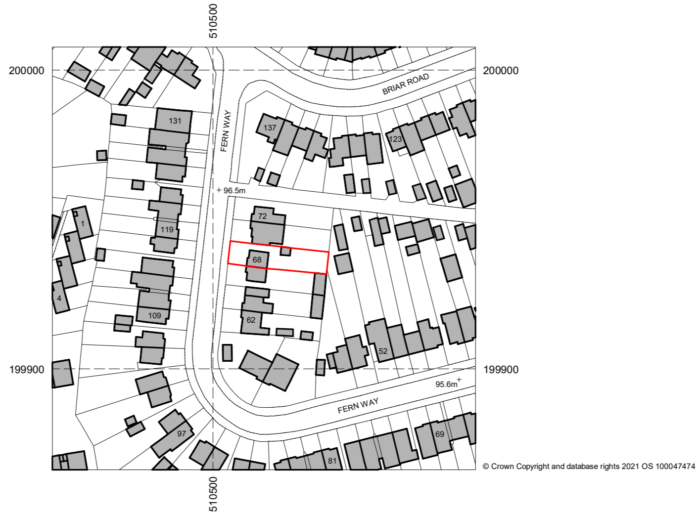
1 21011 - LOCATION PLAN 1 : 1250