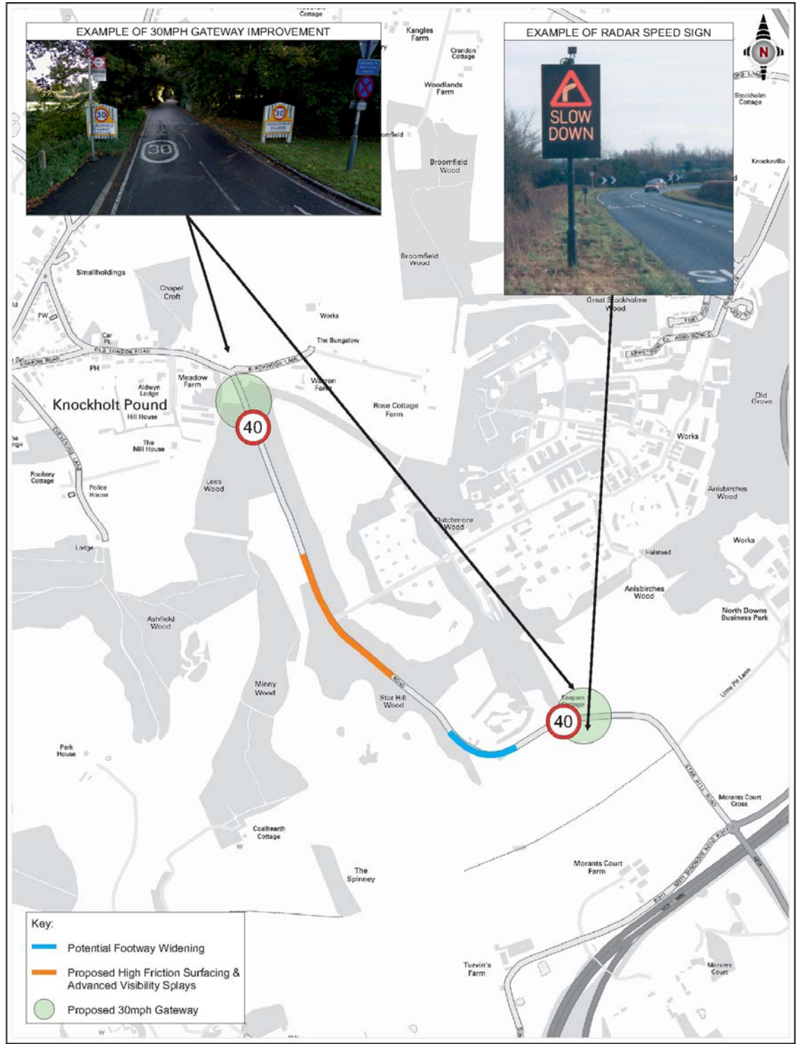
Figure 2: Proposed scheme