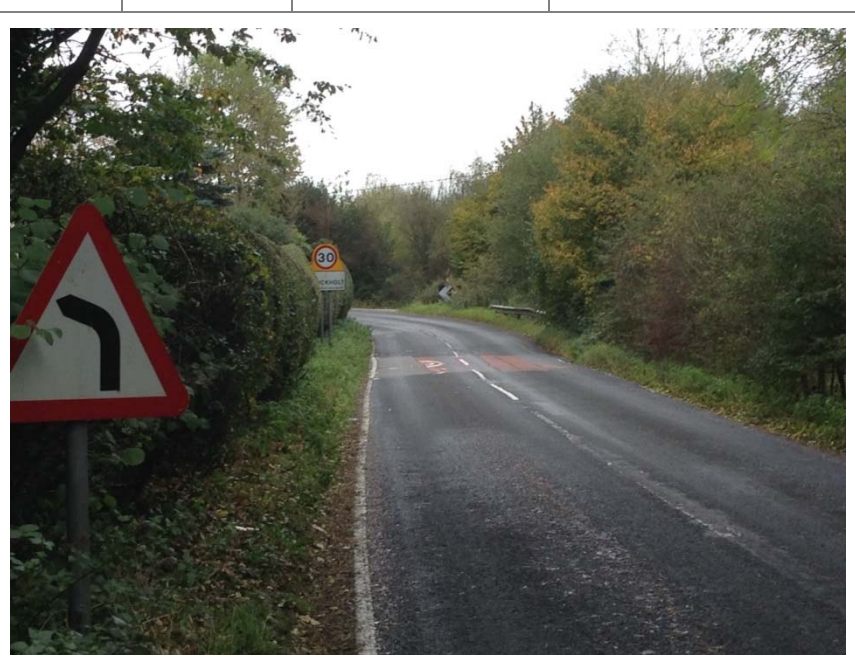
Photo 4: Faded entry treatment on entry to Knockholt Pound (south of Birchwood Lane)

Accident data for a period of almost 7 years has been analysed for the Star Hill Road corridor. During that time there have been 7 recorded injury accidents, all slight in severity between Knockholt Pound Village and the A224 (excluding accidents at the A224 junction itself).