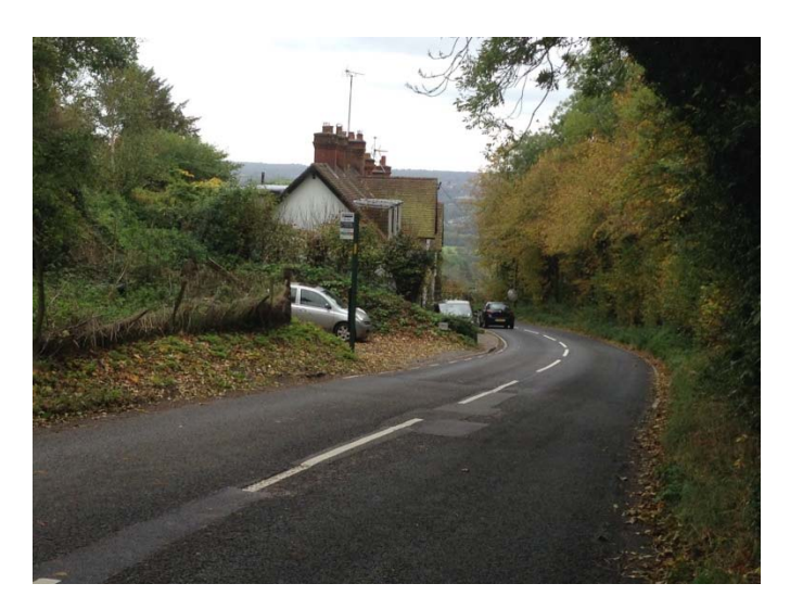
Photo 1: Informal parking and bus stop located to the north of the cottages

There is very limited frontage activity along the road. A small number of cottages front the road to the south of the site at the sharp bend (Photo 1). Whilst some of the cottages have off-street parking others share a small plot of land just to the north of the cottages where there is parking available to accommodate up to 4 cars. There is also a bus stop for the 402 bus service at this location. There is a narrow footway (which is likely to be private) along the frontage of these cottages.