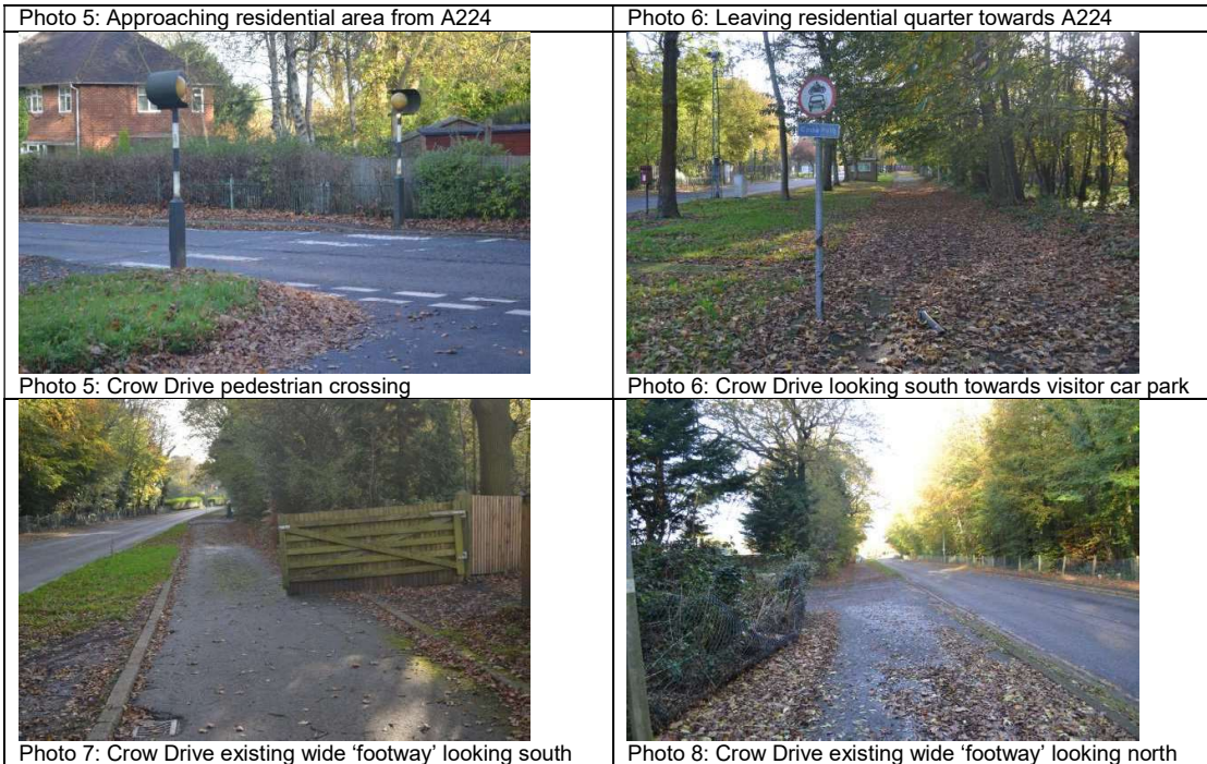
Figure 3: Crow Drive layout