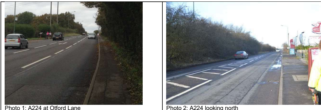
Figure 6 shows some photographs of the A224 corridor and access to Knockholt station.

There is scope to upgrade the existing cycle parking facilities at the Knockholt Station.