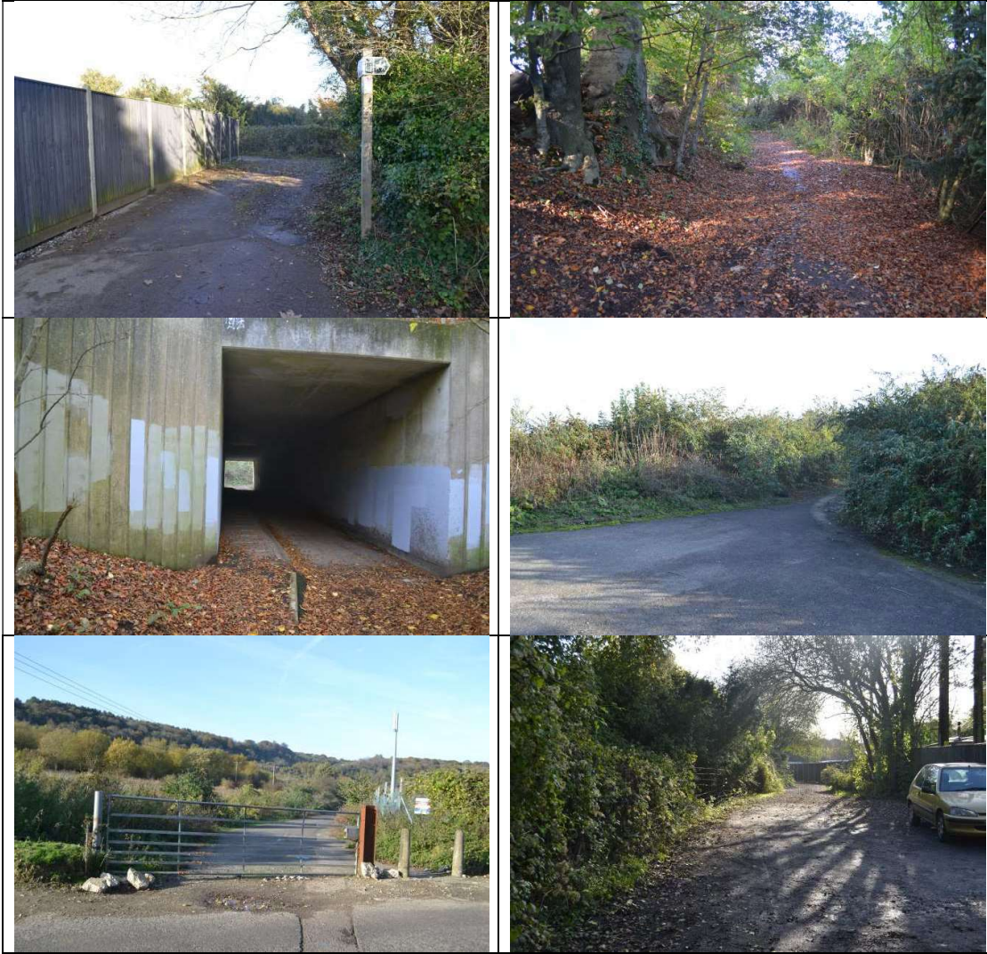
Figure 7: Access towards Otford using existing bridleways