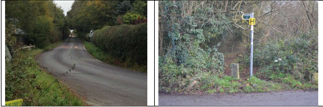
Figure 4: Access to Knockholt Pound