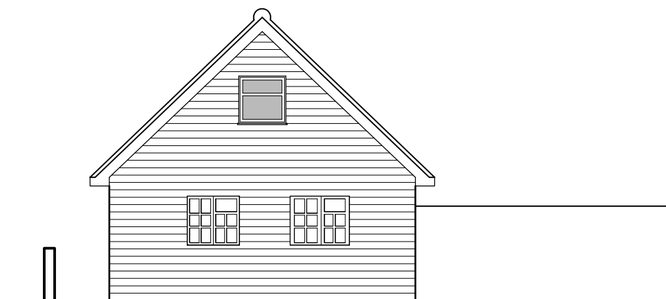
Existing East Elevation 1:100