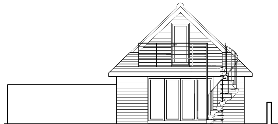
Existing West Elevation 1:100