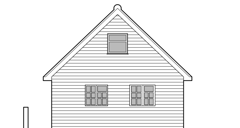
Proposed East Elevation 1:100