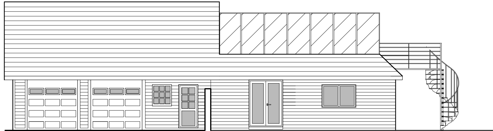
Proposed North Elevation 1:100

This drawing is protected by copyright and must not be copied or reproduced without the written consent of Graham Simpkin Planning. All dimensions and sizes to be checked on site. North points are indicative. ©