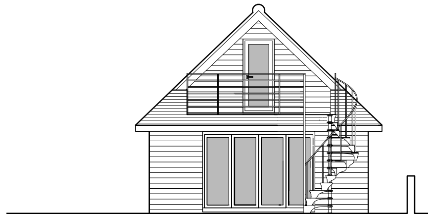
Proposed West Elevation 1:100