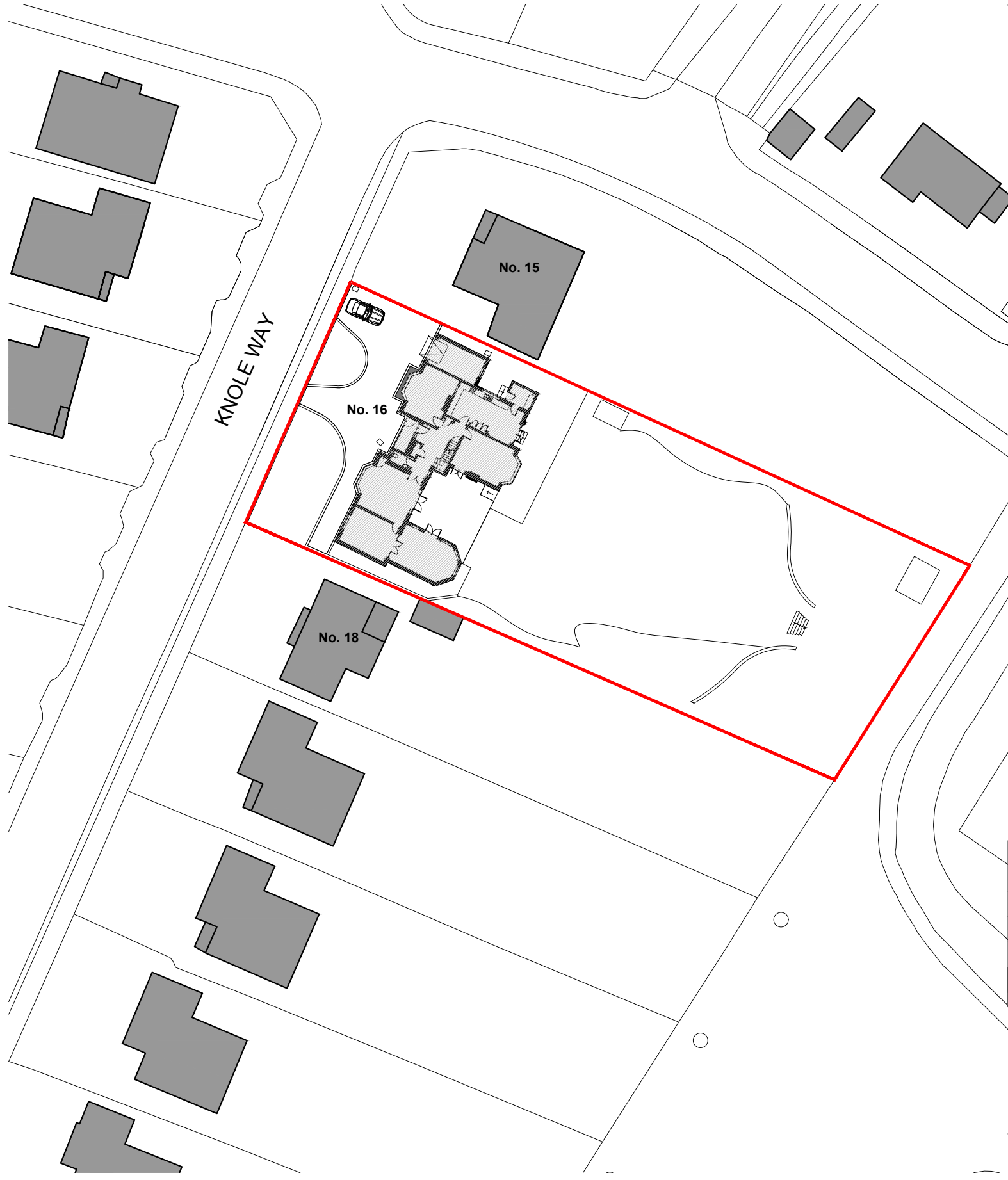
1 SITE LOCATION PLAN SCALE: 1:1250