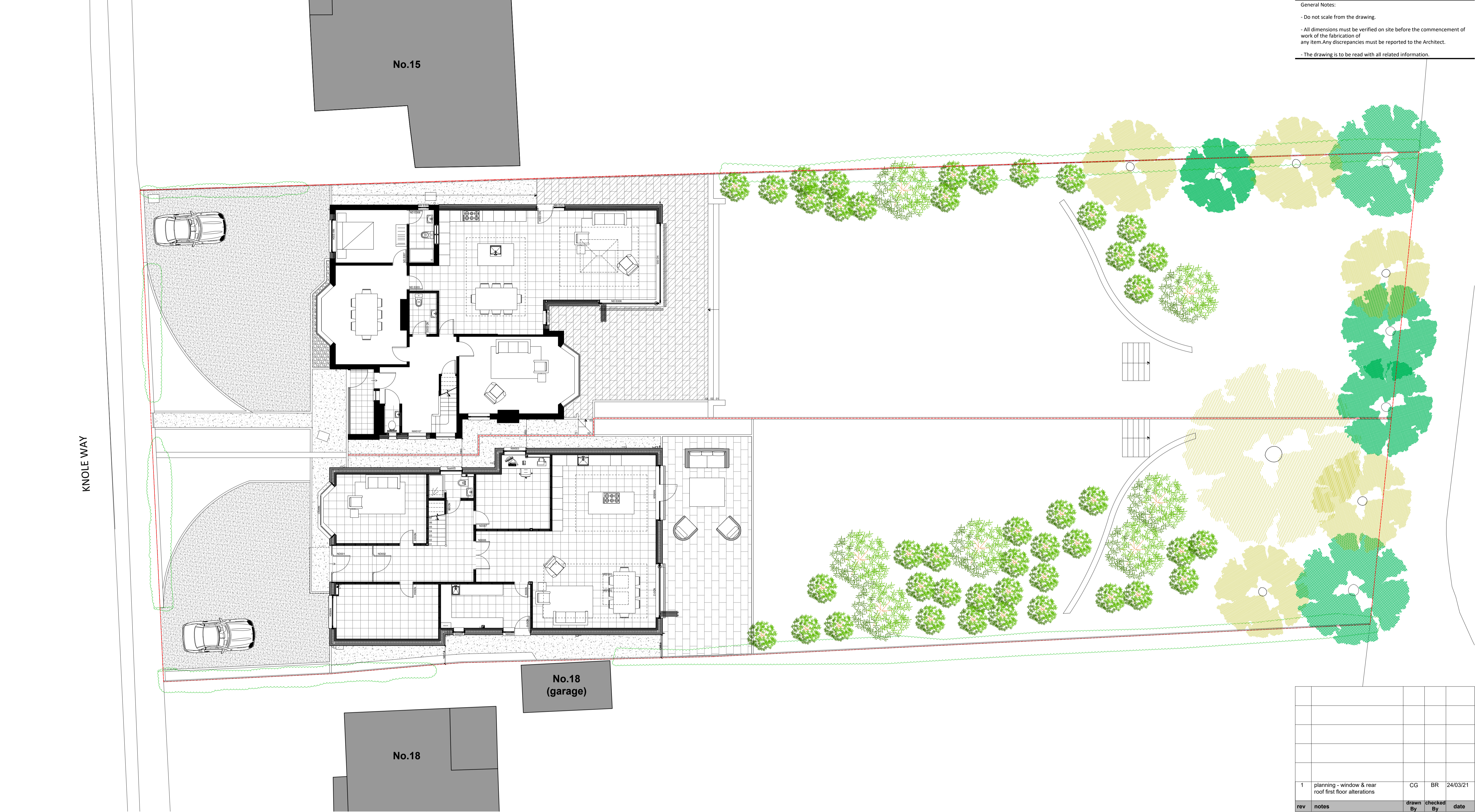
1 SITE PLAN 1:100

General Notes: - Do not scale from the drawing. - All dimensions must be verified on site before the commencement of work of the fabrication of any item. Any discrepancies must be reported to the Architect. - The drawing is to be read with all related information.