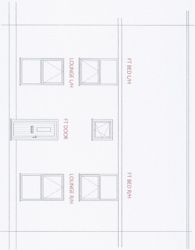
PROPOSED FRONT ELEVATION 1/100

DRG 001 EXISTING/PROPOSED FRONT ELEVATIONS 1/100