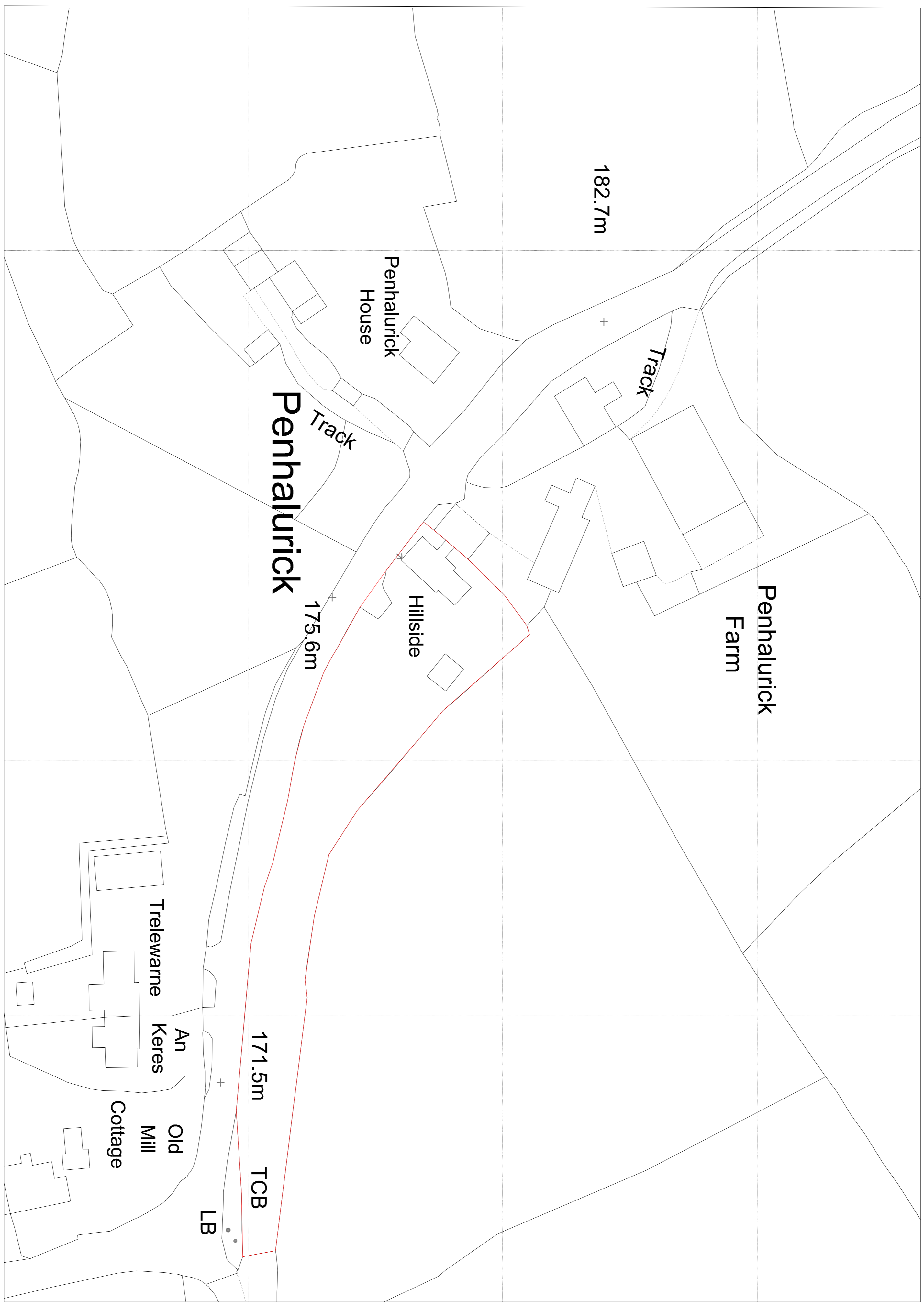
SITE PLAN Scale 1:500 @ A1