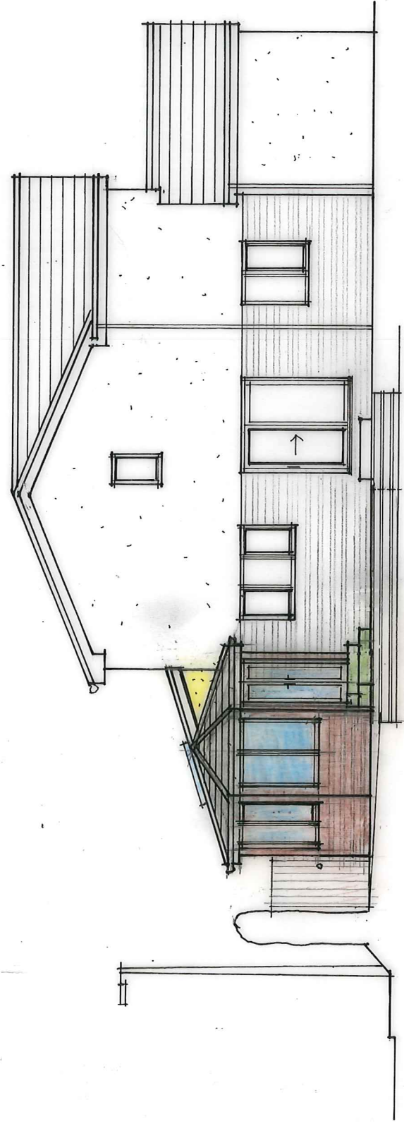
PROPOSED REAR ELVEVATION