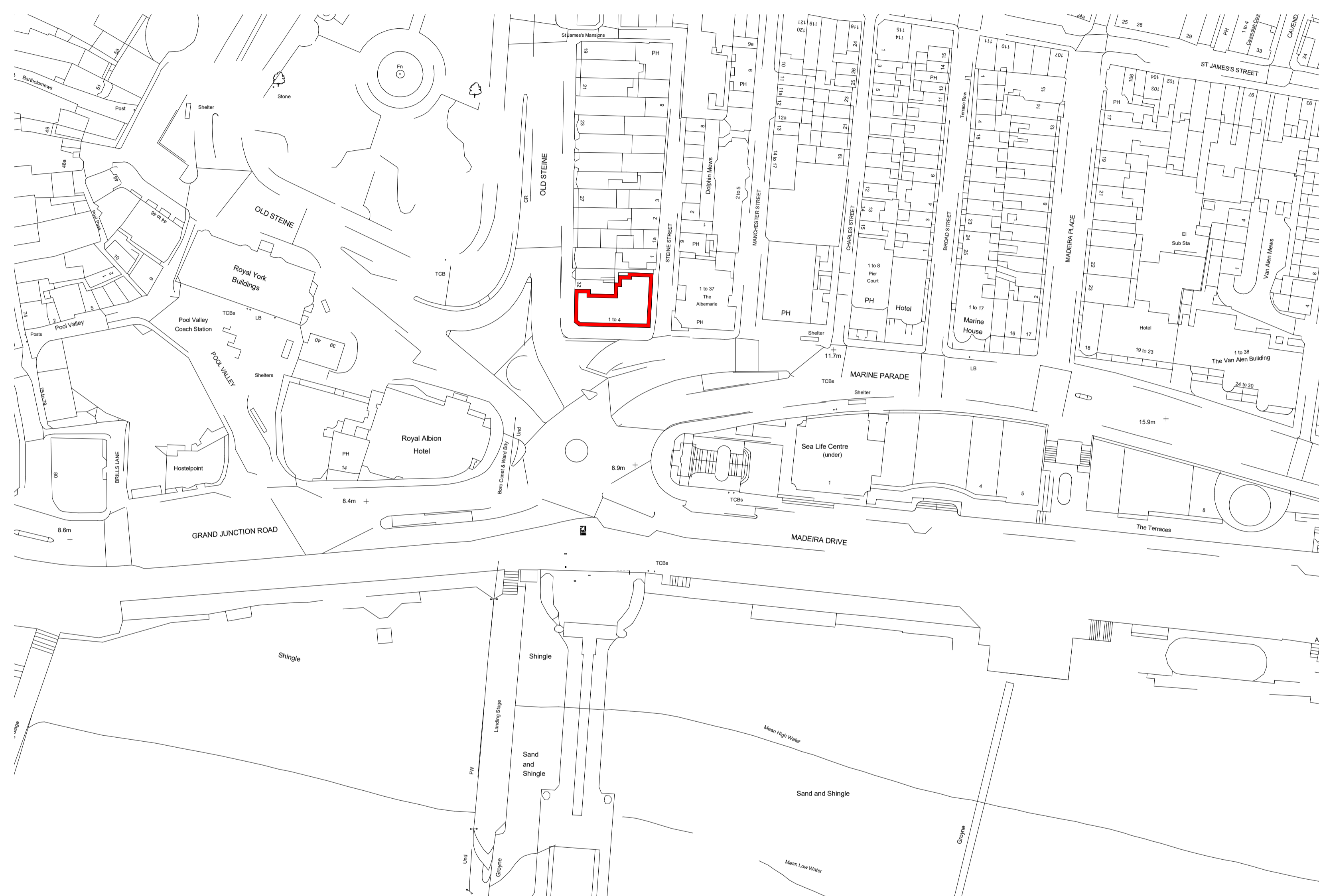
1 (01) SITE PLAN - Existing Floor Plan 22.08.000 1 : 1250 @ A1