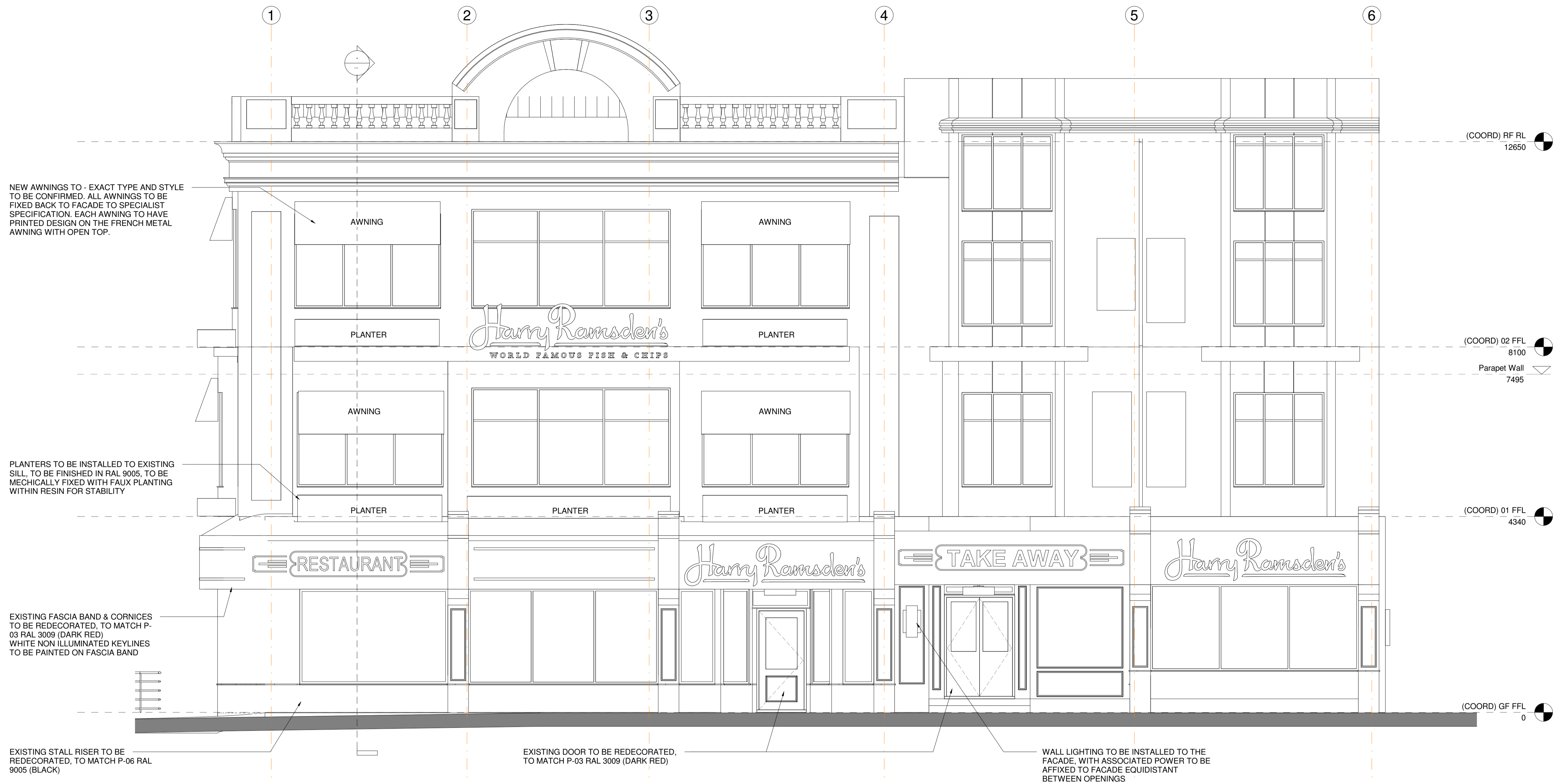
1 (16) NORTH EXTERNAL ELEVATION (FP) - Proposed Elevation 1 : 50 @

NOTE WINDOW FRAMEWORK TO BE DECORATED IN DARK RED P-03 TO MATCH RAL 3009 ENTIRE FACADE TO BE MADE GOOD WHERE APPROPRIATE AND PAINTED P-05 PURE BRILLIANT WHITE WEATHERSHIELD EXTERIOR SATIN PAINT. ALL ILLUMINATED SIGNAGE TO FALL WITHIN THE GUIDELINE LEVELS FOR ENGLAND AS STATED IN THE PROFESSIONAL LIGHTING GUIDE 05; (THE BRIGHTNESS OF ILLUMINATED ADVERTISEMENTS (2015) - INSTITUTE OF LIGHTING PROFESSIONALS), OF 600 CANDELAS PER M2 WITH LUMENS PER MODULE IS 117.6 LINEAR M/ 500 CANDELAS M2.