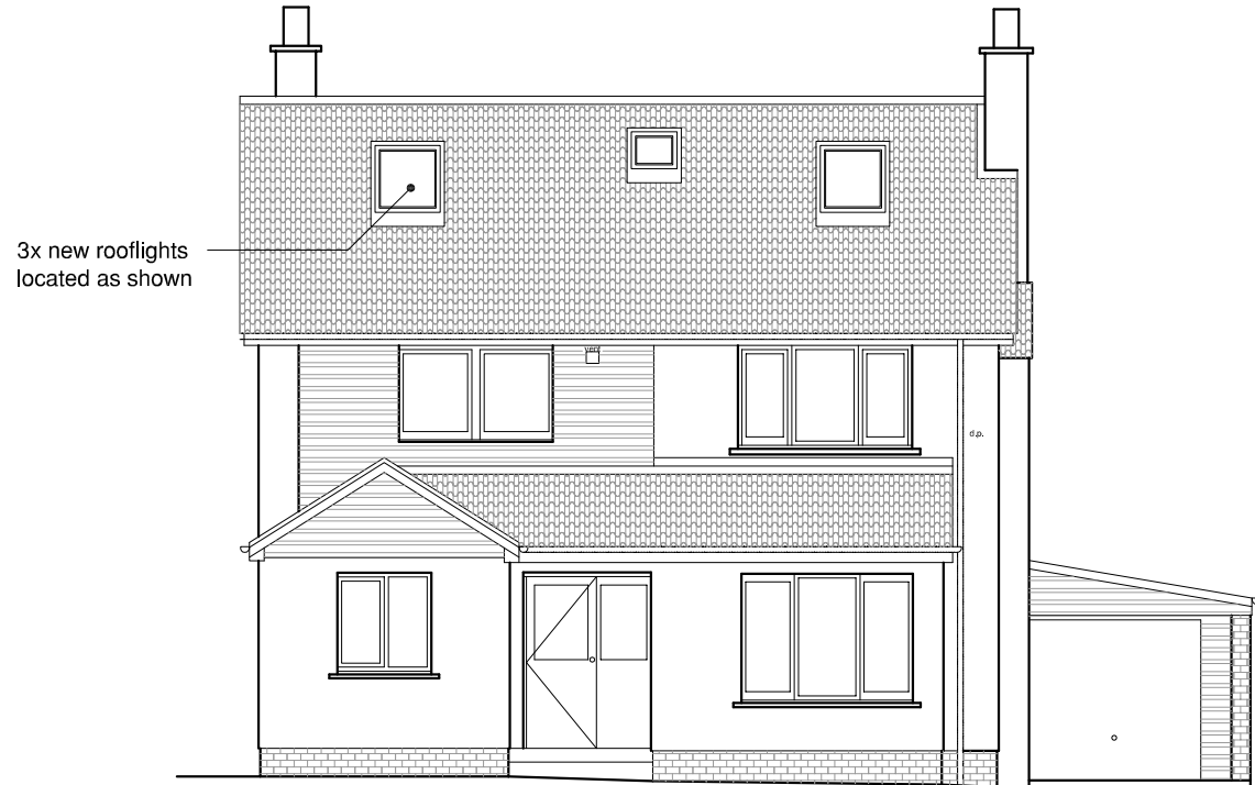
3 SOUTH ELEVATION SCALE 1:100 @ A3